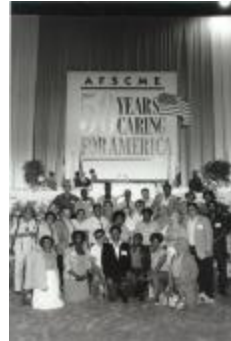
AFSCME 50th anniversary (JuJo_0001)