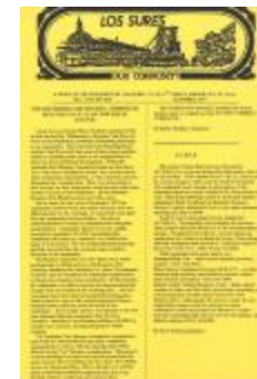
The Southside Fair Housing Committee Fighting Once Again for Equal Justice (Sures_b01_f01_001)