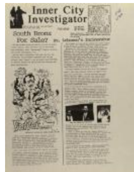
Inner City Investigator (RiPe_b23_f01_0020_pg01)