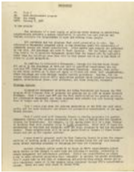
Correspondence from the Metropolitan/Urban Research and Strategy Center (CENTRO_b30_f01_0009_pg01)