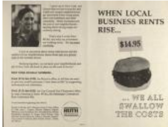
When Local Business Rents Rise . . . We All Pay the Price (RiPe_b19_f06_0001_pg01)