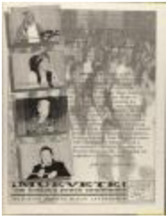
¡MUÉVETE! Boricua Youth Conference (RiPe_b32_f04_0001)