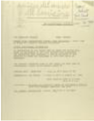
Puerto Rican Contemporary Graphic Arts Exhibition (PuBe_b26_f04_0015_pg01)