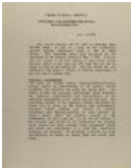
Cross Cultural Forum II: Towards A Framework For Social Transformation (RiPe_b29_f02_0019_pg01)