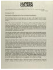
Correspondence from the Center for Puerto Rican Studies (RiPe_b25_f07_0010_pg01)