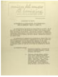
Aspectos de la Esclavitud En Puerto Rico / Aspects of Slavery in Puerto Rico (PuBe_b26_f04_0011_pg01)