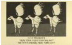
R-T-P Presents "New York Puerto Rican Art" (PuBe_b26_f04_0008_cover)