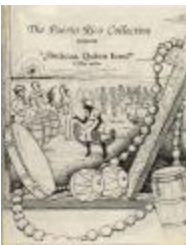
The Puerto Rico Collective Presents Boricua, Quien Eres? (RiPe_b33_f07_0003_pg01)