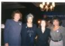
Mujeres Destacadas / Featured Women (EICa_b09_f_0019)