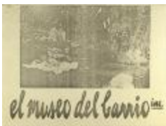
Art as Survival (PuBe_b26_f04_0049_cover)