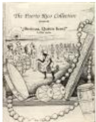
Boricua, Quien Eres? / Boricua, Who Are You? (CENTRO_b94_f01_0016_pg01)