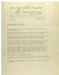
El Museo del Barrio press release (PuBe_b26_f04_0010_pg01)