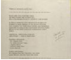
Race and the Construction of the Puerto Rican Identity: New Paradigms on Race, Identity, and Power (RiPe_b20_f04_0048)