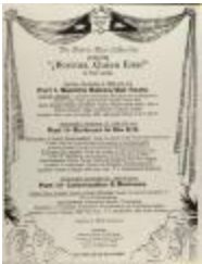
The Puerto Rico Collective Presents Boricua, Quien Eres? (RiPe_b33_f07_0005)