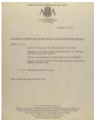
Association of Hispanic Arts and the Council of Puerto Rican Elected Officials - Agenda (PuBe_b25_f06_0003)