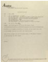
Correspondence from ASPIRA (CENTRO_b91_f08_0011)