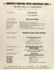
¡MUÉVETE! Boricua Youth Conference 1995 - Taking Back La Comunidad (RiPe_b32_f04_0012_pg01)