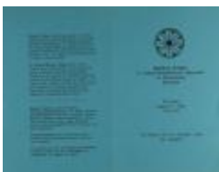
Building Bridges: A Cross-Generational Approach to Community Activism (RiPe_b18_f04_0017_pg01)