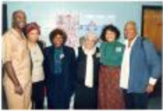
Group of people at the ¡MUÉVETE! Boricua Youth Conference (Muev_b01_f0036)