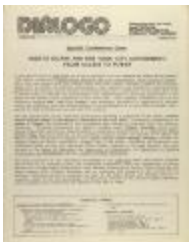
Puerto Ricans and New York City Government: From Access to Power (RiPe_b23_f01_0022_pg01)