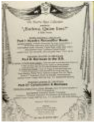
Boricua, Quien Eres? / Boricua, Who Are You? (RiPe_b20_f04_0013)