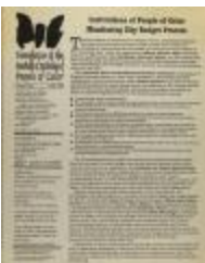
Institutions of People of Color Monitoring City Budget Process (RiPe_b23_f03_0010_pg01)