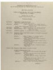
Puerto Ricans and City Government: From Access to Power (RiPe_b31_f05_0013_pg01)