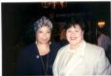
Mujeres Destacadas / Featured Women (EICa_b09_f_0016)