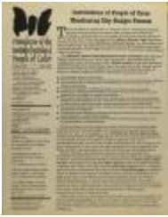
Institutions of People of Color Monitoring City Budget Process (RiPe_b21_f01_0031_pg01)