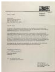
Correspondence from the Caribbean Cultural Center and the Azabache Committee (RiPe_b28_f09_0025)