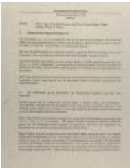
Roundtable of People of Color - Minutes (RiPe_b22_f08_0036_pg01)