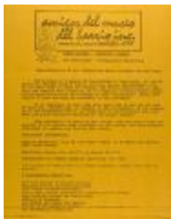
Identification of Art Collections Which Document Our Heritage (PuBe_b26_f04_0019)