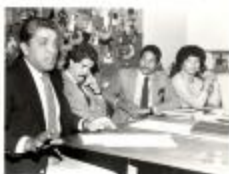
Conference on the Arts of Puerto Rico (EICa_b09_f_0058)