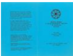
Building Bridges: A Cross Generational Approach to Community Activism (RiPe_0108)