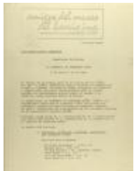
La Herencia de Nuestros Ninos / The Legacy of Our Children (PuBe_b26_f04_0009_pg01)