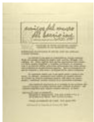
Exhibición de Arte-Exhibición Fotográfica / Art Exhibition-Photo Exhibition (PuBe_b26_f04_0017_pg01)