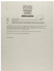
Correspondence from Puerto Rican Legal Defense & Education Fund (RiPe_b33_f10_0008_pg01)