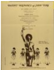
Ballet Hispanico of New York (PuBe_b25_f07_0014)