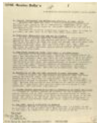
NPRC Member Bulletin (CENTRO_b94_f07_0006_pg01)