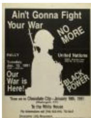
Ain't Gonna Fight Your War No More (RiPe_b20_f03_0052)