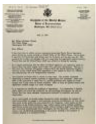
Correspondence from Nydia Velázquez (RiPe_b24_f03_0008_pg01)