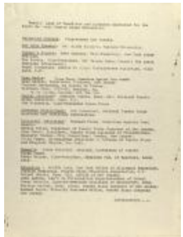
Partial List of Panelists and Speakers Confirmed for the First National Puerto Rican Convention