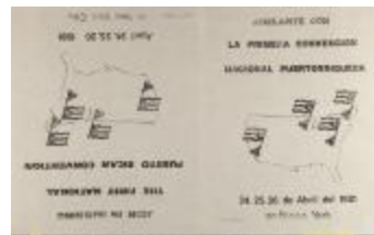
Adelante Con La Primera Convención Nacional Puertorriqueña / Join in Building The First National Puerto Rican Convention (RiPe_b23_f07_0020_pg01)