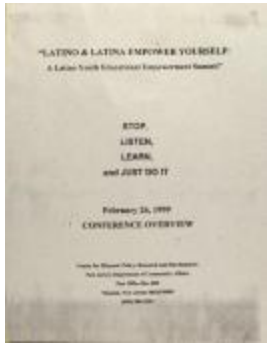
Latino & Latina Empower Yourself: A Latino Youth Educational Empowerment Summit (RiPe_b28_f10_0012_pg01)