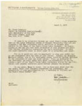
Correspondence from Rutgers University (CENTRO_b01_f06_0026)