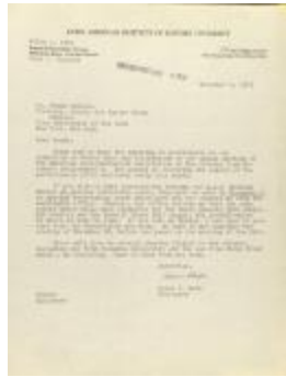
Correspondence from the Latin American Institute of Rutgers University (CENTRO_b01_f04_0036)