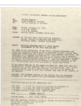
Columbia University Seminar on Full Employment (CENTRO_b27_f08_0037)