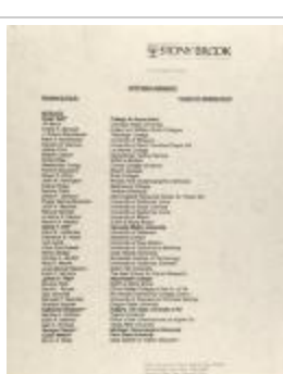
OpenMind Members (CENTRO_b28_f01_0005_pg01)