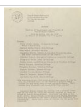
Puerto Rican Council on Higher Education - Minutes (CENTRO_b96_f05_0007_pg01)