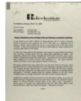
Report Questions Use of Stop Data as a Measure of Racial Profiling (RiPe_b24_f01_0052_pg01)