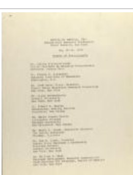
ASPIRA - Educational Research Conference - Roster of Participants (CENTRO_b91_f07_0001_pg01)