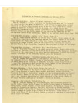
Information on Proposed Candidates for National Office (CENTRO_b93_f09_0018)