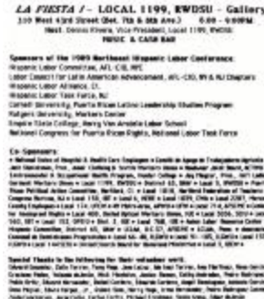
Northeast Hispanic Labor Conference (EdGo_b08_0016)