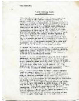
"Nota Biográfica" / Biographical Note (ViFr_NotasBiograficas_001)