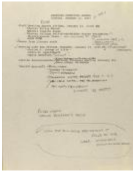
Puerto Rican Council on Higher Education - Steering Committee Agenda (CENTRO_b96_f05_0029)