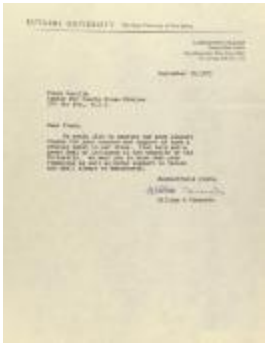
Correspondence from Rutgers University (CENTRO_b01_f04_0022)