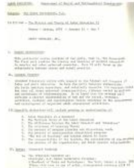
The History and Theory of Labor Education II syllabus (EdGo_b02_0021)