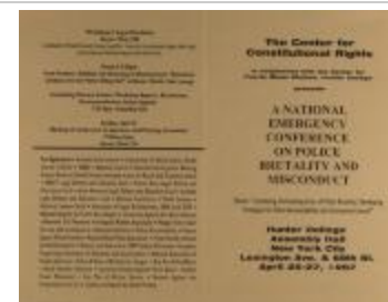
National Emergency Conference on Police Brutality and Misconduct (RiPe_b25_f06_0008_pg01)