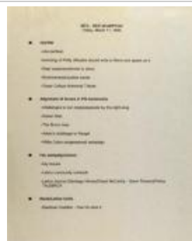
Mtg - Rev. Sharpton (RiPe_b24_f06_0001_pg01)