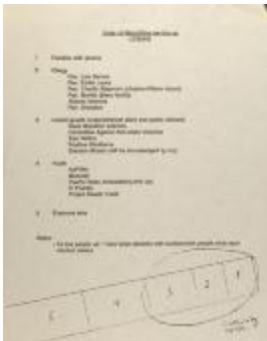
Order of March/How We Line Up (RiPe_b20_f09_0018_pg01)