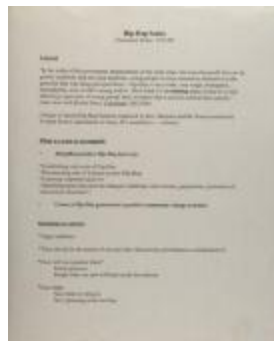
Hip-Hop Series: Discussion Notes (RiPe_b21_f04_0001)