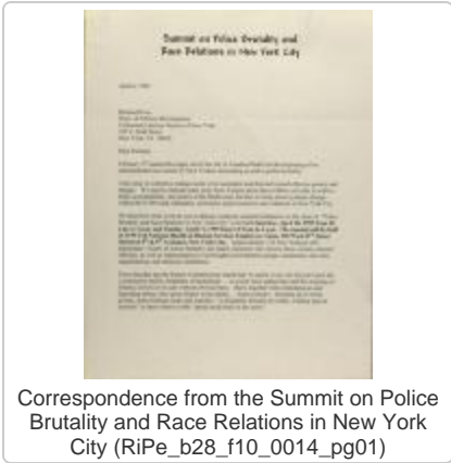
Correspondence from the Summit on Police Brutality and Race Relations in New York City (RiPe_b28_f10_0014_pg01)