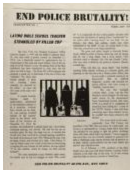
End Police Brutality! (RiPe_b23_f03_0015_pg01)