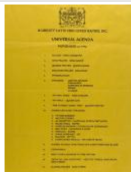
Universal Agenda (RiPe_b25_f01_0004)