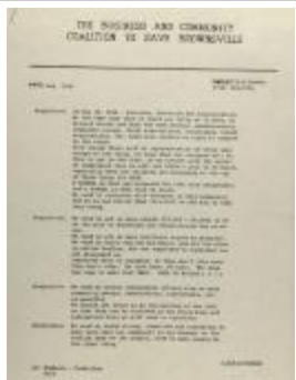
The Business and Community Coalition To Save Brownsville (RiPe_b24_f02_0013_pg01)