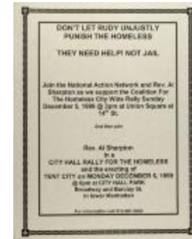
Don't Let Rudy Unjustly Punish the Homeless - They Need Help! Not Jail (RiPe_b20_f04_0063)