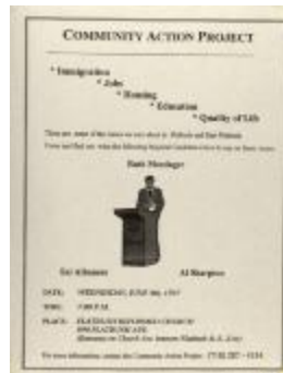
Community Action Project (RiPe_b20_f04_0032)