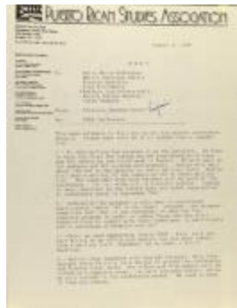
Memorandum from the Puerto Rican Studies Association (CENTRO_b98_f07_0012_pg01)