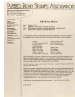
Memorandum from the Puerto Rican Studies Association (CENTRO_b99_f02_0029)