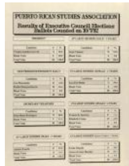
Puerto Rican Studies Association - Results of Executive Council Elections Ballots Counted on 10/7/92