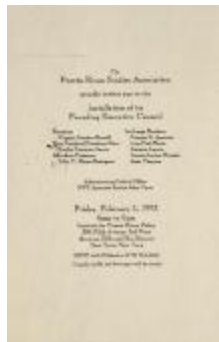
Installation of the PRSA Founding Council (CENTRO_b99_f02_0035)