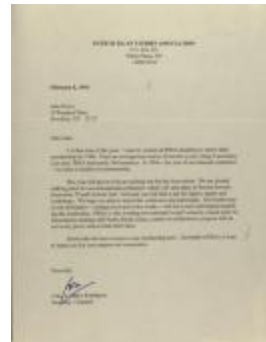
Correspondence from the Puerto Rican Studies Association (CENTRO_b99_f03_0001_pg01)