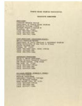
Puerto Rican Studies Association - Executive Committee (CENTRO_b99_f02_0007_pg01)