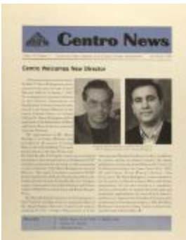
Centro News (RiPe_b25_f09_0023_pg01)