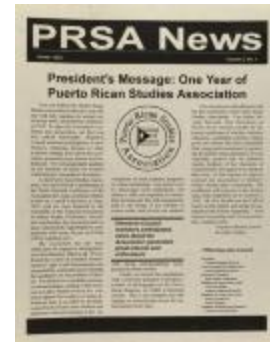
President's Message: One Year of Puerto Rican Studies Association (CENTRO_b99_f03_0003_pg01)