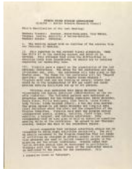
Puerto Rican Studies Association and the Social Science Research Council - Meeting Minutes (CENTRO_b99_f02_0041_pg01)