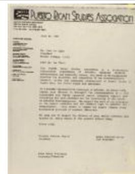
Correspondence from the Puerto Rican Studies Association (CENTRO_b99_f02_0037)