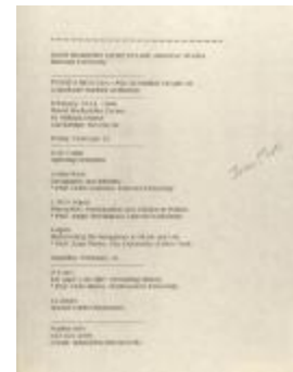
Puerto Rico - One Hundred Years Of... (RiPe_b20_f04_0046)