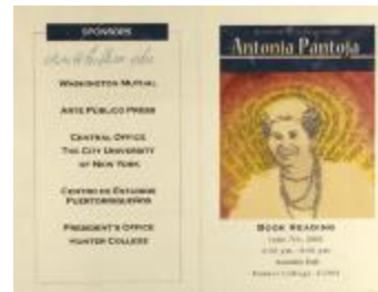
Memoir of a Visionary - Antonia Pantoja (RiPe_b19_f09_0022_pg01)