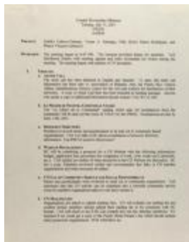
Comité Noviembre - Minutes (RiPe_b27_f06_0016_pg01)