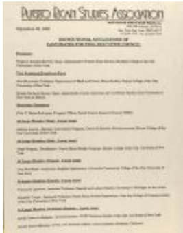
Institutional Affiliations of Candidates for PRSA Executive Council (CENTRO_b99_f02_0024)