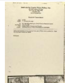
Correspondence from the Institute for Puerto Rican Policy (CENTRO_b99_f02_0039_pg01)