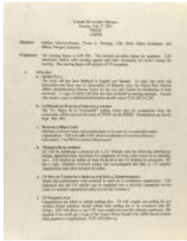
Comité Noviembre - Minutes (CENTRO_b93_f03_0006_pg01)