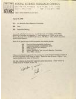
Memorandum from the Social Science Research Council (CENTRO_b99_f02_0040)