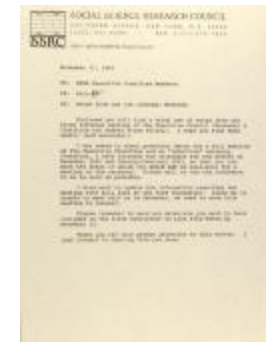
Memorandum from the Social Science Research Council (CENTRO_b99_f02_0030_pg01)