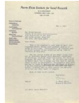
Correspondence from Puerto Rican Institute for Social Research (CENTRO_b01_f07_0001)