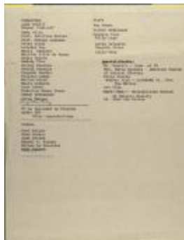
Committee and Staff List (PuBe_b25_f08_0011)