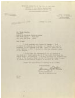
Correspondence from the New York Board of Education (CENTRO_b01_f05_0004_pg01)