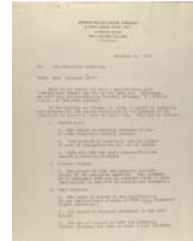
Memorandum from the Puerto Rican Legal Defense & Education Fund, Inc. (CENTRO_b173_f03_0010_pg01)