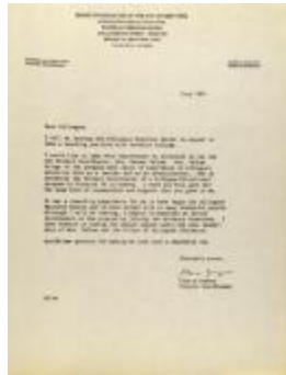
Correspondence from the New York City Board of Education (CENTRO_b01_f05_0027)