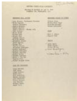
National Puerto Rican Conference - RSVP List (CENTRO_b94_f06_0013_pg01)