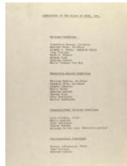
Committees of the Board of NPRC, Inc. (CENTRO_b94_f07_0011_pg01)