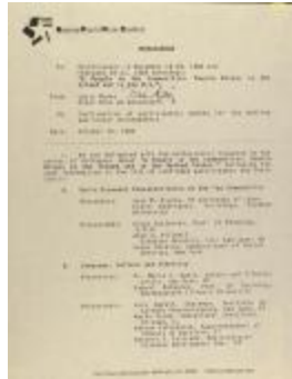
Memorandum from the National Puerto Rican Coalition (CENTRO_b95_f01_0019_pg01)