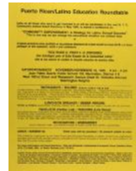
Community Empowerment: A Strategy For Latino School Success (RiPe_b33_f09_0005)