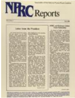
NPRC Reports (CENTRO_b95_f01_0016_pg01)