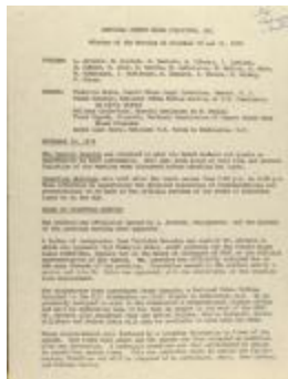
National Puerto Rican Coalition, Inc. - Meeting Minutes (CENTRO_b94_f06_0025_pg01)