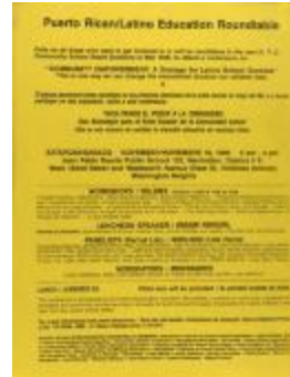
"COMMUNITY EMPOWERMENT: A Strategy for Latino School Success" (CENTRO_b97_f06_0018)