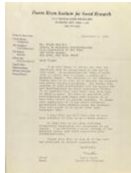
Correspondence from the Puerto Rican Institute for Social Research (CENTRO_b01_f05_0030_pg01)