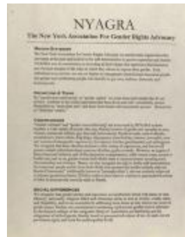
The New York Association for Gender Rights Advocacy (RiPe_b21_f02_0025_pg01)