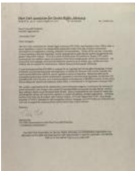
Correspondence from New York Association for Gender Rights Advocacy (RiPe_b21_f02_0023)