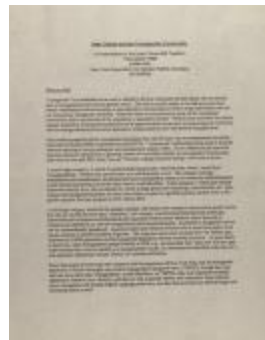
Hate Crimes and the Transgender Community (RiPe_b21_f02_0024_pg01)