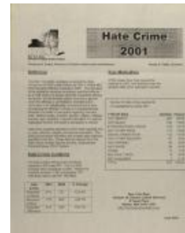
Hate Crime 2001 (RiPe_b21_f02_0026_pg01)