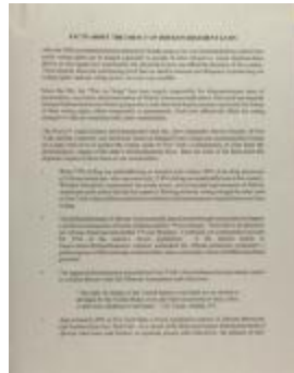
Facts About the Impact of Disfranchisement Laws (RiPe_b21_f03_0001_pg01)