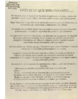
Esto Es Lo Que Esta Pasando / This is what is happening (CENTRO_b97_f06_0005)