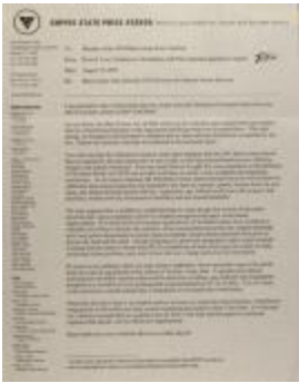
Correspondence from Empire State Pride Agenda (RiPe_b21_f02_0027)