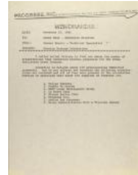
Correspondence from PROGRESS, Inc. (CENTRO_b28_f07_0013)