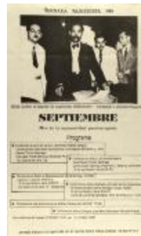
Jornada Albizuista (CENTRO_b95_f03_0023)