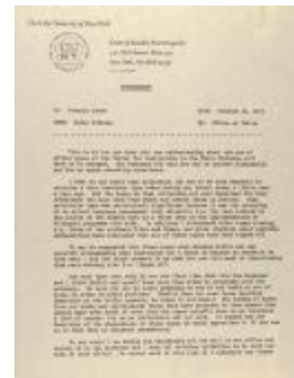
Memorandum from the Center for Puerto Rican Studies (CENTRO_b124_f08_0002_pg01)