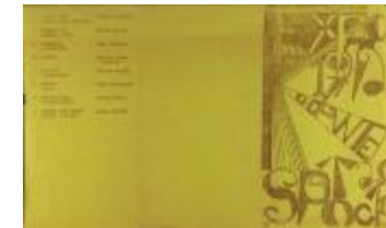
Exposición Rodante / Traveling Exposition (PuBe_b26_f01_0019_pg01)