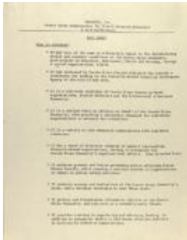
PROGRESS, Inc. - Fact Sheet (CENTRO_b28_f05_0019_pg01)