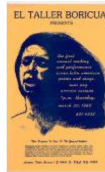
Taller Boricua poster (PuBe_b25_f07_0001)