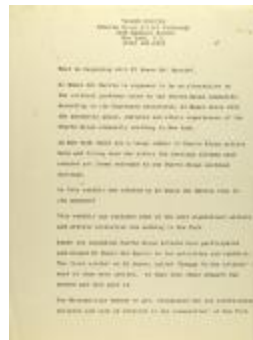
What is Happening with El Museo del Barrio? (PuBe_b26_f04_0051_pg01)