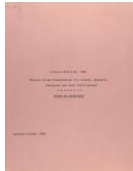
PROGRESS, Inc. (Puerto Rican Organization for Growth, Research, Education and Self-Sufficiency, Inc.) - Board