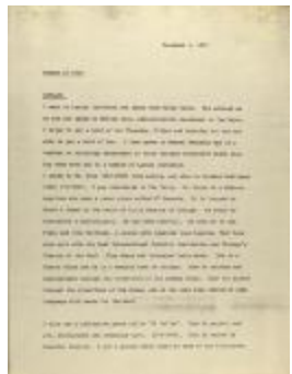
Resume of Trip (CENTRO_b123_f06_0001_pg01)