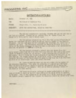
Correspondence from PROGRESS, Inc. (CENTRO_b28_f07_0024_pg01)