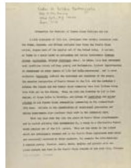
Prospectus for Festival of Puerto Rican Folklore and Art (CENTRO_b123_f02_0001_pg01)