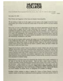
Correspondence from the Center for Puerto Rican Studies (RiPe_b25_f07_0010_pg01)