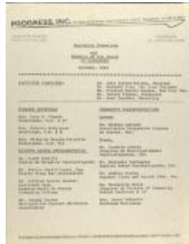
PROGRESS, Inc. - Executive Committee and Members of the Board of Directors (CENTRO_b28_f05_0031_pg01)