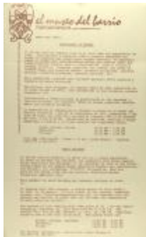
El Museo Del Barrio - Comunicado de Prensa / Press Release (PuBe_b26_f04_0002)