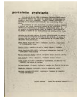
Portafolio Proletario / Proletarian Portfolio (CENTRO_b123_f02_0006_r)