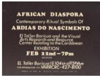
African Diaspora - Contemporary Ritual Symbols of Abdias Do Nascimento (OGPRUS_MD_b2220_f01_0002_front)