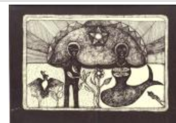
Visual Arts Research and Resource Center Relating to the Caribbean (OGPRUS_MD_b2220_f01_0001_front)