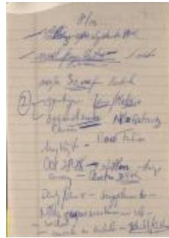
Manuscript Notes on Comité Noviembre (CENTRO_b92_f05_0003_pg01)