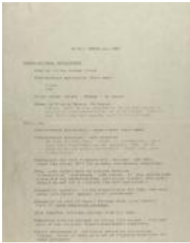
Community Service Society - To Do List (RiPe_b29_f05_0002_pg01)