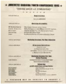
¡MUÉVETE! Boricua Youth Conference 1995 - Taking Back La Comunidad (RiPe_b32_f04_0012_pg01)