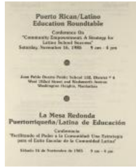
Community Empowerment: A Strategy For Latino School Success (RiPe_b33_f09_0004_pg01)