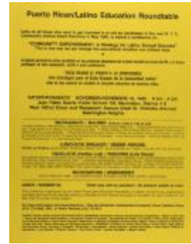
Community Empowerment: A Strategy For Latino School Success (RiPe_b33_f09_0005)