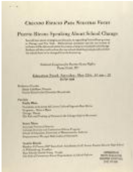
Creando Espacio Para Nuestras Voces / Creating Space for Our Voices (CENTRO_b94_f01_0011)