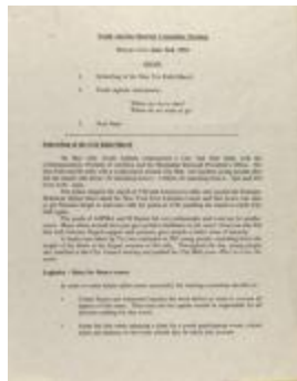
Youth Agenda Steering Committee Meeting - Minutes (RiPe_b34_f06_0014_pg01)