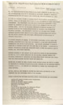
Puerto Rican/Latino Education Roundtable (RiPe_b33_f09_0001)