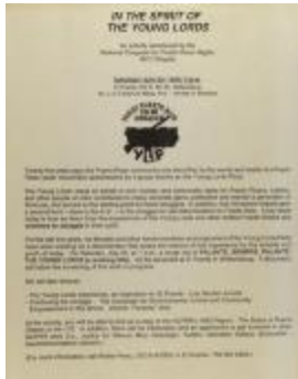
In the Spirit of the Young Lords (RiPe_b34_f04_0044_pg01)