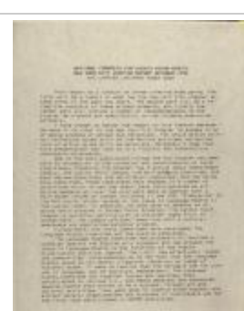
National Congress for Puerto Rican Rights - New York City Chapter Report (CENTRO_b94_f04_0009_pg01)