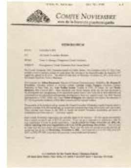
Correspondence from Comité Noviembre (CENTRO_b93_f03_0007_pg01)