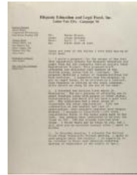
Correspondence from Hispanic Education and Legal Fund, Inc. (RiPe_b31_f04_0001_pg01)