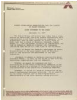
Puerto Rican/Latino Organizations Call For Clarity on Recent Promises (CENTRO_b26_f06_0016_pg01)