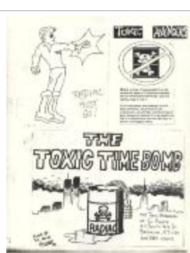
The Toxic Time Bomb (JMor_ToxicAvengers_b01_006)