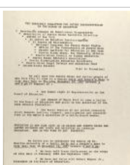
The Emergency Coalition for Latino Representation on the Board of Education (CENTRO_b94_f01_0060_pg01)