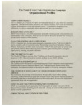
The People United Voter Registration Campaign - Organizational Profiles (RiPe_b30_f07_0014_pg01)