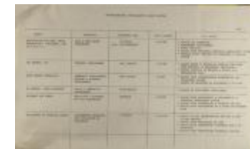
Organizational Development Client History (RiPe_b29_f02_0009_pg01)