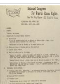
National Congress for Puerto Rican Rights - Coordinating Committee Meeting Agenda (CENTRO_b94_f02_0036_pg01)