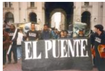
El Puente (RiPe_0120)