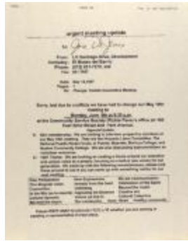
Correspondence from El Museo del Barrio (CENTRO_b92_f03_0022)