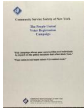
The People United Voter Registration Campaign (RiPe_b30_f07_0016_pg01)