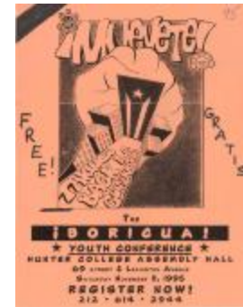
¡MUÉVETE! Boricua Youth Conference (Muev_b_f_0011)