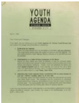
Correspondence from Youth Agenda: Strong Youth, Strong City (RiPe_b34_f06_0012_pg01)