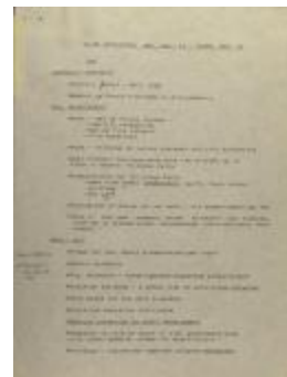
Community Service Society - Notes (RiPe_b29_f02_0003_pg01)