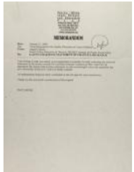
Correspondence from Puerto Rican Legal Defense & Education Fund (RiPe_b33_f10_0008_pg01)