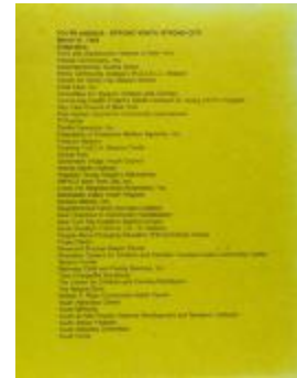
Youth Agenda - Strong Youth, Strong City (RiPe_b34_f06_0003)