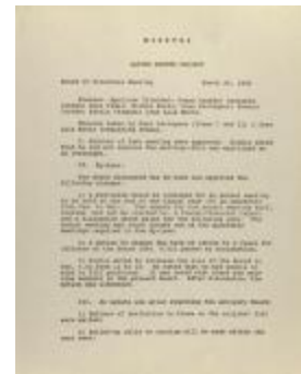
Latino Rights Project - Board of Directors Meeting (RiPe_b31_f09_0008_pg01)