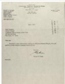
Correspondence to Community Service Society (RiPe_b28_f10_0021_pg01)