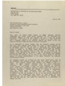
Correspondence from the Puerto Rican Council on Higher Education (CENTRO_b95_f06_0004_pg01)