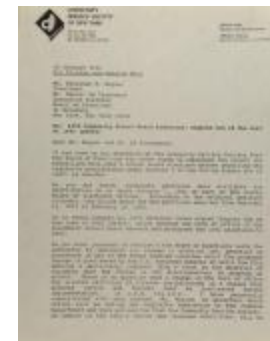
Correspondence from Community Service Society of New York (RiPe_b30_f01_0014_pg01)