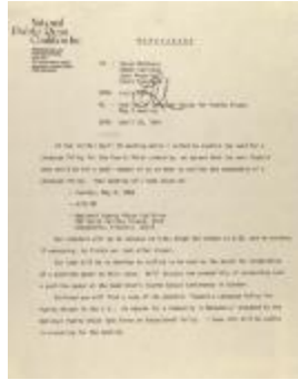
Memorandum from the National Puerto Rican Coalition (CENTRO_b94_f08_0024_pg01)