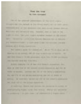
Free the Vote (RiPe_b21_f03_0004_pg01)