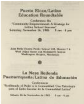
Community Empowerment: A Strategy For Latino School Success (RiPe_b33_f09_0004_pg01)