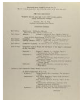
Puerto Ricans and City Government: From Access to Power (RiPe_b31_f05_0013_pg01)