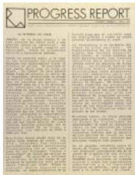
Progress Report (RiPe_b30_f04_0019_pg01)