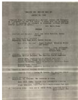
English Yes: English Only No (CENTRO_b97_f06_0038_pg01)