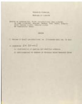
Research Planning - Agenda (CENTRO_b97_f06_0058)