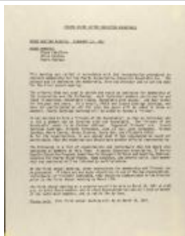
Puerto Rican/Latino Education Roundtable - Board Meeting Minutes (CENTRO_b97_f08_0017_pg01)