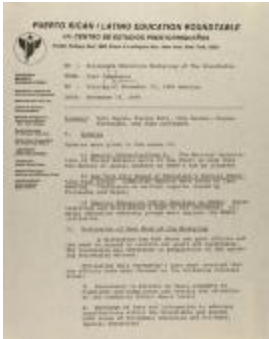
Memorandum from the Puerto Rican/Latino Education Roundtable (CENTRO_b97_f05_0020_pg01)