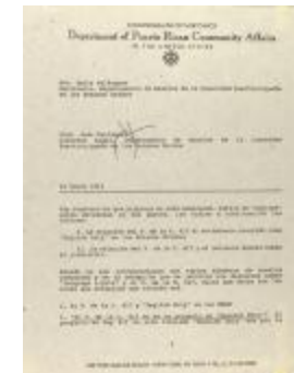
Protest Against "English-Only" Movement in the United States (CENTRO_b97_f06_0048_pg01)