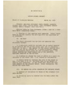
Latino Rights Project - Minutes (RiPe_b31_f10_0013_pg01)