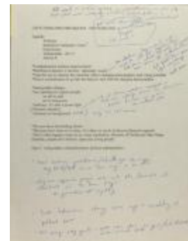
CSS Fundraising Breakfast - Notes (RiPe_b29_f05_0006_pg01)