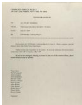
Correspondence from Community Service Society (RiPe_b28_f10_0024_pg01)