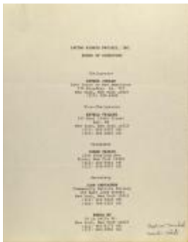
Latino Rights Project, Inc. - Board of Directors (RiPe_b31_f10_0007_pg01)