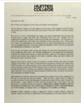
Correspondence from the Center for Puerto Rican Studies (RiPe_b25_f07_0010_pg01)