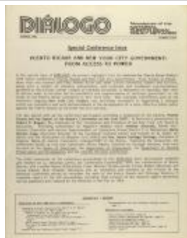
Puerto Ricans and New York City Government: From Access to Power (RiPe_b23_f01_0022_pg01)