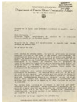
Proyecto de la Cámara 417 estableciendo el Español como idioma oficial de Puerto Rico / House Bill 417 establishing Spanish as the