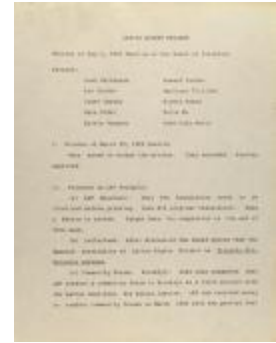
Latino Rights Project - Minutes (RiPe_b31_f10_0014_pg01)