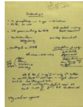
District 27 (RiPe_b21_f01_0004_pg01)