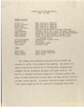
Language Policy Meeting Minutes (CENTRO_b94_f08_0022_pg01)