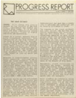
Progress Report (RiPe_b30_f04_0018_pg01)