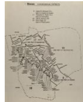
Bronx Congressional Districts (RiPe_b29_f02_0012_pg01)