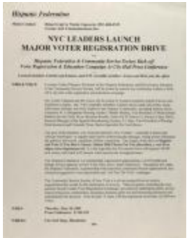
NYC Leaders Launch Major Voter Registration Drive (RiPe_b30_f03_0055)