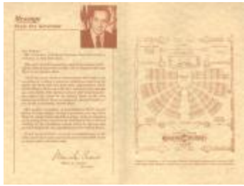
Message from the Governor (OGRI_0004)