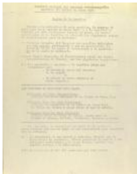
Congreso Nacional Pro Derechos Puertorriqueños - Asamblea del Estado de Nueva York / National Congress for Puerto