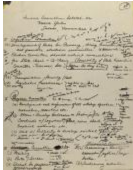
Primera Asamblea Estatal de Nueva York / First State Assembly of New York (RiPe_b22_f08_0001_pg01)