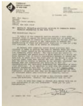
Correspondence from Community Service Society (RiPe_b28_f08_0017)