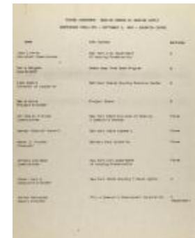
Taking Inventory: Housing Demand Vs. Housing Supply (RiPe_b32_f08_0003_pg01)