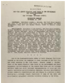
Minutes of the New York State Minority Task Force on the Environment and Waste Management and the Citizens' Advisory