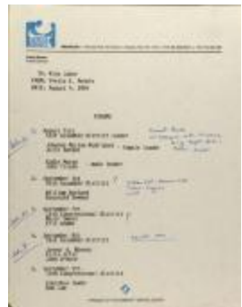
Community Service Society Memo (RiPe_b30_f06_0004)