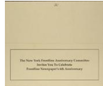
A Reception and Forum to Celebrate Frontline Newspaper's 6th Anniversary (RiPe_b23_f07_0007_r)