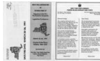
Meet the Lawmakers at Somos Uno IV, Hispanics in the 90's: The Quest for Prosperity (JoMo_b12_f10_0002_pg01)