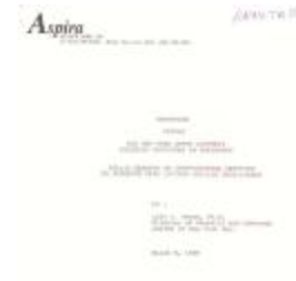
Public Hearing on Instructional Services To Students With Limited Proficiency (LOR0_0011)