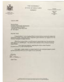
Correspondence from the State Assembly of New York (RiPe_b28_f10_0022)