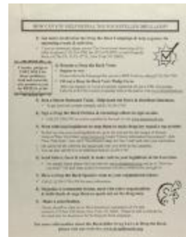
How Can You Help Repeal the Rockefeller Drug Laws? (RiPe_b30_f07_0010_pg01)