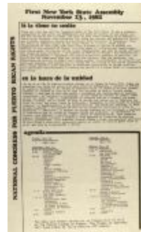
First New York State Assembly (CENTRO_b94_f01_0032_r)