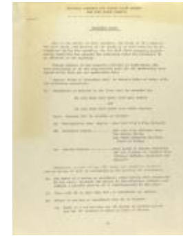
National Congress for Puerto Rican Rights - New York State Council - Assembly Rules (CENTRO_b93_f08_0002_pg01)