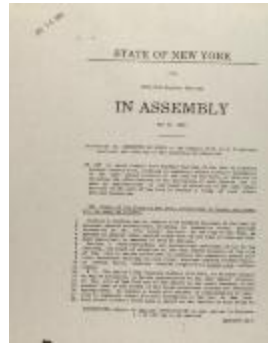
State of New York in Assembly (RiPe_b22_f08_0015_pg01)