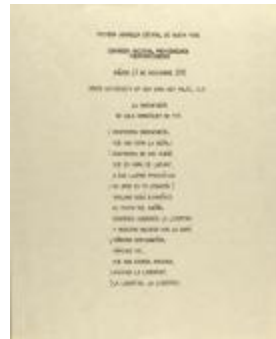
La Borinqueña (CENTRO_b94_f01_0031)