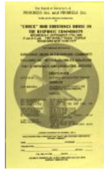
"Crack" and Substance Abuse in the Hispanic Community (CENTRO_b28_f06_0018_pg01)