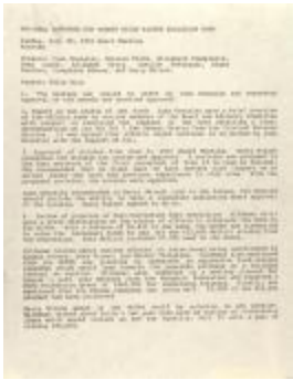
National Congress for Puerto Rican Rights Education Fund - Minutes (CENTRO_b93_f11_0003_pg01)