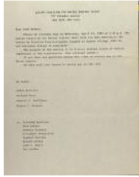
Correspondence from Latino Coalition for Racial Justice (RiPe_b21_f08_0010_pg01)