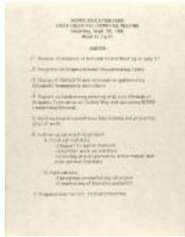
NCPRR Education Fund - First Executive Committee Meeting - Agenda (CENTRO_b93_f11_0004)