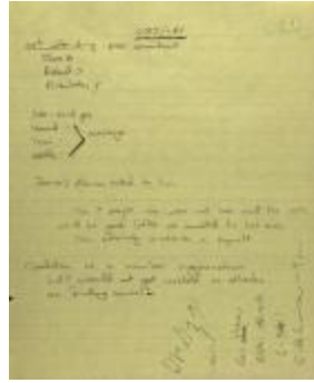
Notes of the Latino Coalition for Racial Justice (RiPe_b21_f08_0013_pg01)