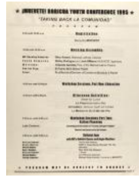
¡MUEVETE! Boricua Youth Conference 1995 - Taking Back La Comunidad (RiPe_b32_f04_0012_pg01)