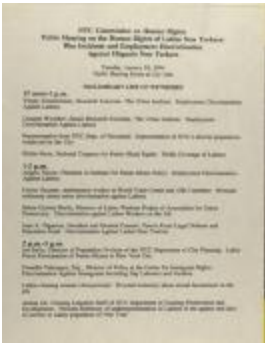
The New York City Commission on Human Rights Public Hearing on the Human Rights of Latino New Yorkers: Bias Incidents and