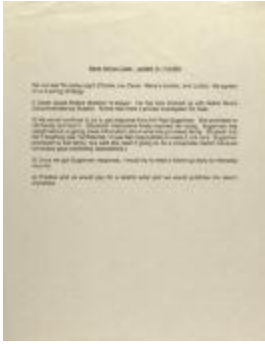
Rene Olmos Case - Update 11/13/90 (RiPe_b20_f09_0009)