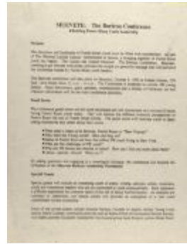
MUEVETE: The Boricua Conference - Building Puerto Rico Leadership (RiPe_b32_f04_0006_pg01)