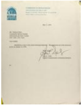
Correspondence from New York City Human Rights Commission (RiPe_b28_f09_0003_pg01)