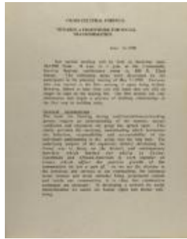
Cross Cultural Forum II: Towards A Framework For Social Transformation (RiPe_b29_f02_0019_pg01)