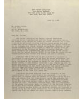
Correspondence from The Latino Coalition for Racial Justice (RiPe_b21_f09_0015_pg01)