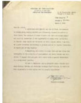
Correspondence from the Board of Education of New York City (JeCo_b17_f12_0030)