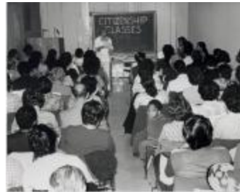
Citizenship Classes (KaAn_b01_f25_0002)