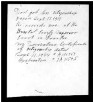
Note on Citizenship Papers (JeCo_b01_f05_0173)