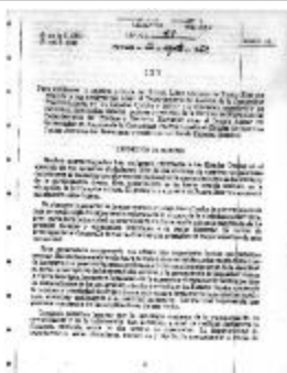
Transition Report: December 1992 (Appendix 1) (OGPRUS_TR_DEC1992_APDX01)