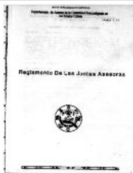
Transition Report: December 1992 (Appendix 2) (OGPRUS_TR_DEC1992_APDX02)