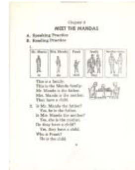
English Exercise- Readings and Speaking Practice (KaAn_b08_f11_0001_pg01)