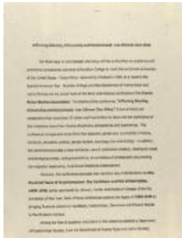
Affirming Identity, Citizenship and Nationhood: Los Últimos Cien Años / The Last Hundred Years