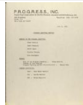
PROGRESS - Program Committee Meeting (CENTRO_b28_f08_0003)