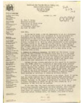
Correspondence from the Institute for Puerto Rican Policy (CENTRO_b93_f06_0021_pg01)