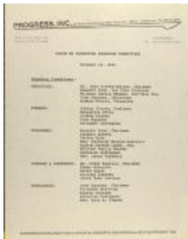
PROGRESS, Inc. - Board of Directors Standing Committees (CENTRO_b28_f08_0010)