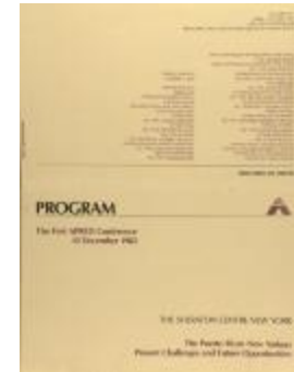
First APRED Conference (CENTRO_b26_f06_0008_pg01)