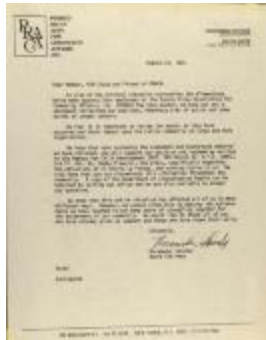
Correspondence from the Puerto Rican Association for Community Affairs (CENTRO_b95_f02_0009_pg01)