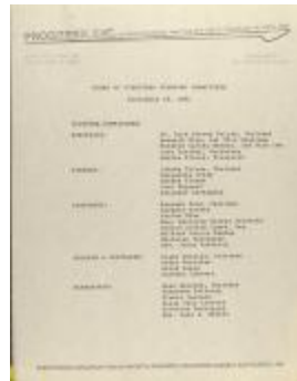
PROGRESS, Inc. - Board of Directors Standing Committees (CENTRO_b28_f08_0007_pg01)