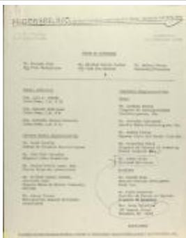
PROGRESS, Inc. - Board of Directors (CENTRO_b28_f05_0003_pg01)