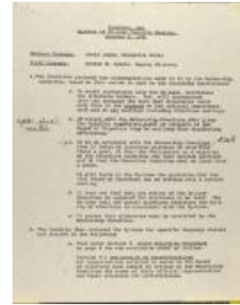
PROGRESS, Inc. - Minutes of By-Laws Committee Meeting (CENTRO_b28_f08_0008_pg01)