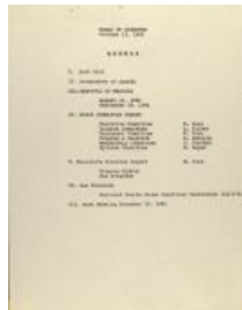
PROGRESS, Inc. - Board of Directors - Agenda (CENTRO_b28_f08_0011)