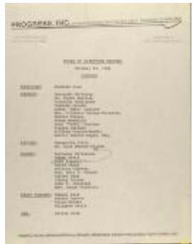
PROGRESS, Inc. - Board of Directors Meeting Minutes (CENTRO_b28_f08_0009_pg01)