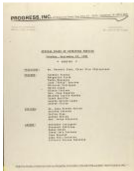
PROGRESS - Special Board of Directors Meeting - Minutes (CENTRO_b28_f08_0006_pg01)