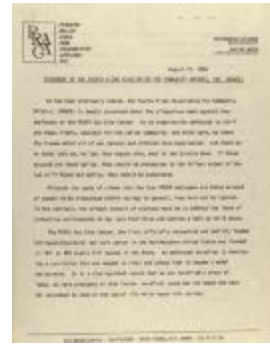
Statement of the Puerto Rican Association for Community Affairs, Inc. (PRACA) (CENTRO_b95_f02_0007_pg01)