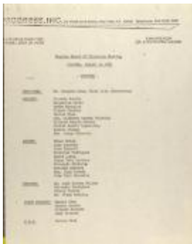
PROGRESS, Inc. - Regular Board of Directors Meeting - Minutes (CENTRO_b28_f08_0005_pg01)