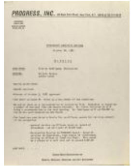
PROGRESS, Inc. - Membership Committee Meeting - Minutes (CENTRO_b28_f08_0016_pg01)