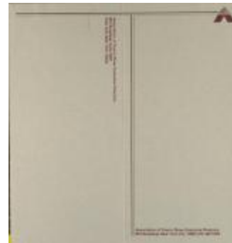
Association of Puerto Rican Executive Directors