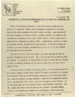
Statement of the Puerto Rican Association for Community Affairs, Inc. (CENTRO_b95_f02_0008_pg01)