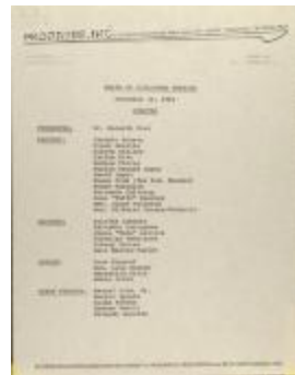
PROGRESS, Inc. - Board of Directors Meeting Minutes (CENTRO_b28_f08_0012_pg01)