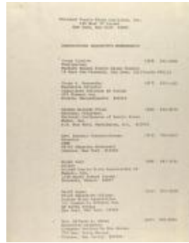
National Puerto Rican Coalition - Organizations Requesting Memberships (CENTRO_b94_f07_0013_pg01)