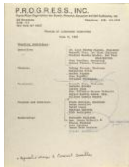
PROGRESS Inc. - Board of Directors Committee (CENTRO_b28_f05_0024_pg01)