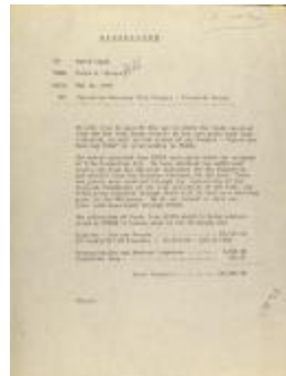
Memorandum from Pedro Rivera (CENTRO_b180_f01_0015)