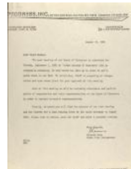
Correspondence from PROGRESS, Inc. (CENTRO_b28_f03_0013_pg01)