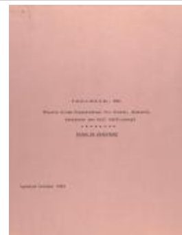
PROGRESS, Inc. (Puerto Rican Organization for Growth, Research, Education and Self-Sufficiency, Inc.) - Board