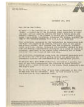
Correspondence from the Association of Puerto Rican Executive Directors (CENTRO_b28_f03_0036)