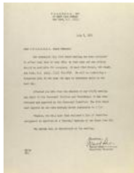
Correspondence from PROGRESS, Inc. (CENTRO_b28_f03_0010_pg01)