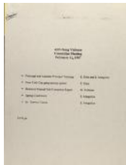
Anti-Gang Violence Committee Meeting (RiPe_b24_f10_0009_pg01)