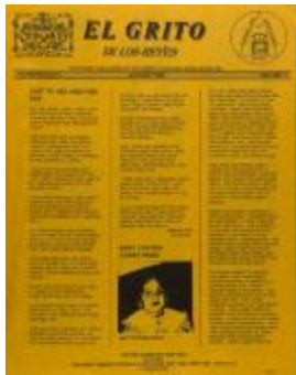
El Grito de los Reyes (RiPe_b25_f01_0003_pg01)