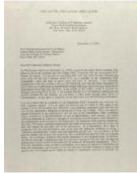
Correspondence from John Jay College of Criminal Justice (RiPe_b26_f04_0007_pg01)