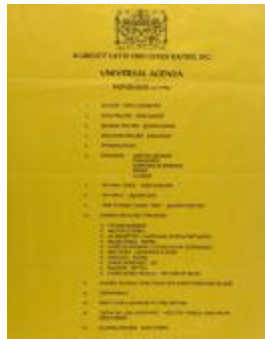
Universal Agenda (RiPe_b25_f01_0004)