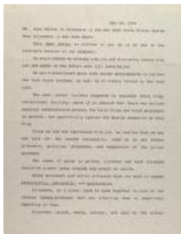
Open Letter to Prisoners in the New York State Prison System (RiPe_b24_f02_0016_pg01)