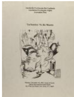
"La Sombra" No Ha Muerto / "The Shadow" Has Not Died (RiPe_b25_f01_0005_pg01)