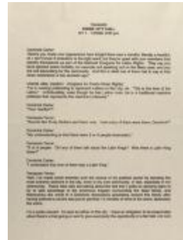
Inside City Hall (RiPe_b20_f09_0023_pg01)