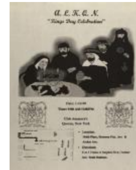
A.L.K.Q.N. - "King's Day Celebration" (RiPe_b25_f01_0008)