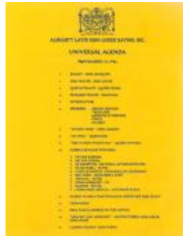
Almighty Latin King Queen Nation, Inc. Universal Agenda (RiPe_0106)