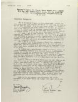
Correspondence from the National Congress for Puerto Rican Rights (RiPe_b25_f07_0027_pg01)