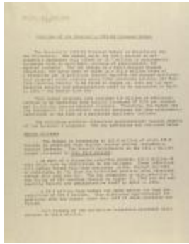
Overview of the Governor's 1983-84 Proposed Budget (CENTRO_b95_f07_0021_pg01)