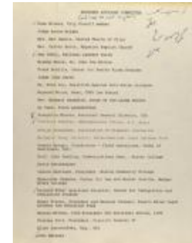
Proposed Advisory Committee of the Latino Rights Project (RiPe_b31_f10_0006)