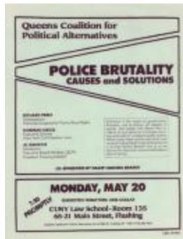
Queens Coalition for Political Alternatives (RiPe_0059)