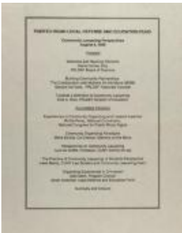
Puerto Rican Legal Defense & Education Fund - Community Lawyering Perspectives - Program (RiPe_b33_f10_0011)