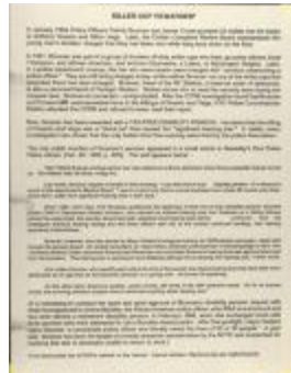
Killer Cop Rewarded (RiPe_b20_f02_0037)