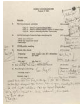
Justice Committee/NCPRR - Agenda (CENTRO_b181_f05_0011)