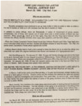
Raise 2,000 Voices for Justice - Racial Justice Day (CENTRO_b181_f05_0020_pg01)