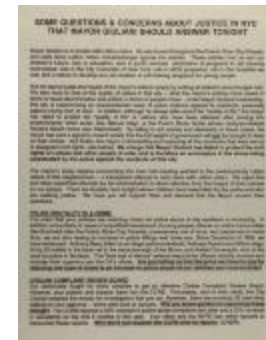
Some Questions & Concerns About Justice in NYC That Mayor Giuliani Should Answer Tonight (RiPe_b21_f01_0019_pg01)