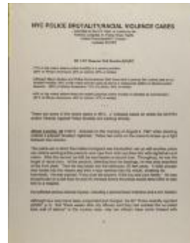
NYC Police Brutality / Racial Violence Cases (RiPe_b21_f02_0020_pg01)