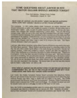
Some Questions About Justice in NYC That Mayor Giuliani Should Answer Tonight (RiPe_b21_f01_0034_pg01)