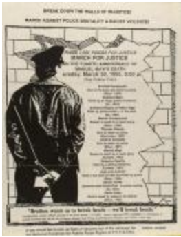
Break Down the Walls of Injustice! - March Against Police Brutality and Racist Violence (CENTRO_b181_f05_0008_r)