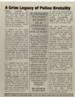
A Grim Legacy of Police Brutality (RiPe_b21_f01_0010)