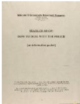
State of Siege: How to Deal With the Police [An Information Packet] (RiPe_b32_f02_0003)