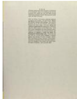
Protest Against Police Brutality (RiPe_b20_f08_0008)