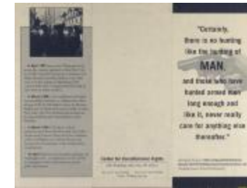
Center for Constitutional Rights (RiPe_b23_f07_0009_r)