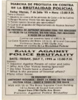
Marcha de Protesta en Contra de la Brutalidad Policial / Rally Against Police Brutality (CENTRO_b181_f05_0009)