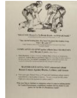
Mayor Giuliani is NOT Concerned About Racial Crimes Against Blacks, Latinos, and Asians (RiPe_b21_f01_0006)