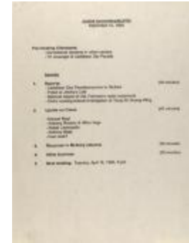
Justice Committee/NCPRR - Agenda (CENTRO_b181_f05_0012)