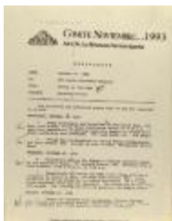
Correspondence from Comité Noviembre (CENTRO_b92_f05_0025_pg01)