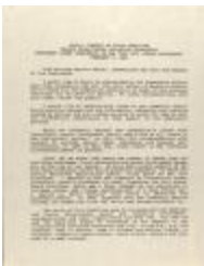
Public Comment (CENTRO_b97_f06_0046_pg01)