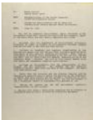
Correspondence to New York City Mayor David Dinkins (RiPe_b34_f01_0030)