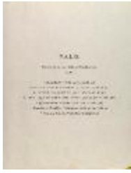
P.A.L.O. - Political Action Latino Organization - Agenda (RiPe_b33_f04_0001)