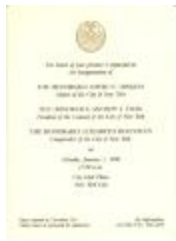
Invitation to the inauguration of New York City Mayor David Dinkins (EiCa_b09_f_0071)