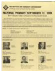
Mayoral Primary: September 12, 1989 (CENTRO_b27_f04_0015_pg01)