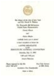
Invitation to reception honoring the Latino Delegates to the Democratic National Convention (EiCa_b09_f_0061)