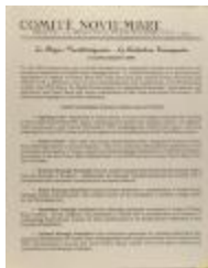
Comité Noviembre - Accomplishments (CENTRO_b92_f05_0011_pg01)