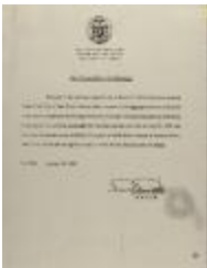
Proclamation of Reward (RiPe_b21_f02_0016)