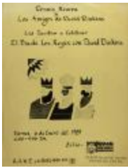
El Día de Los Reyes con David Dinkins / The Day of the Kings with David Dinkins (RiPe_b20_f03_0034)