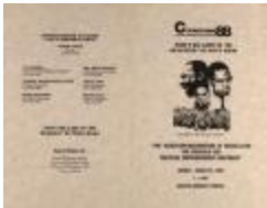
The March on Washington: 25 Years Later The Struggle for Political Empowerment Continues (RiPe_b19_f09_0009_pg01)