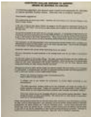
Questions Giuliani Refuses to Answer - Issues He Refuses to Discuss (RiPe_b21_f01_0018)