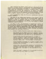
The Puerto Rican/Latino Education Roundtable on Budget Cuts in Education (CENTRO_b97_f07_0002_pg01)