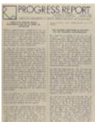
PROGRESS Report (CENTRO_b29_f01_0016_pg01)