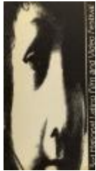
3rd National Latino Film and Video Festival (RiPe_b19_f09_0001_pg01)