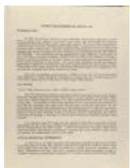
Puerto Rican Heritage Month - 1994 (CENTRO_b92_f06_0004_pg01)