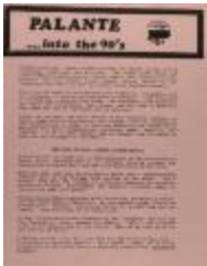
Palante . . . into the 90's (RiPe_b34_f02_0009_pg01)