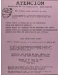
Atención Pacientes de Hospitales Municipales / Attention Patients of Municipal Hospitals (RiPe_b20_f03_0070_r)