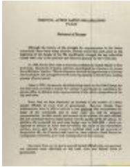
Political Action Latin Organization - P.A.L.O. (RiPe_b33_f04_0002_pg01)