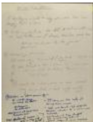
Points Re: This Election (RiPe_b21_f01_0003_pg01)