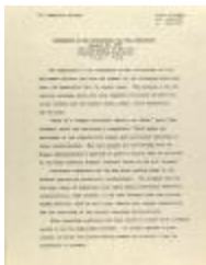
Conference on New Initiatives for Full Employment (CENTRO_b27_f08_0015_pg01)