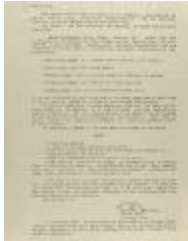
Correspondence from A Campaign for a Peace Dividend (CENTRO_b01_f02_0001_pg01)