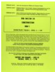
End Racism in Construction Now!! (RiPe_b20_f01_0033)