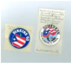
Promotional Campaign Buttons (Buttons_PJH_0001)