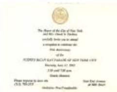
Invitation to celebrate 35th Anniversary of Puerto Rican Day Parade (EICa_b09_f_0060)