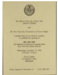
We Are One (RiPe_b21_f05_0006)