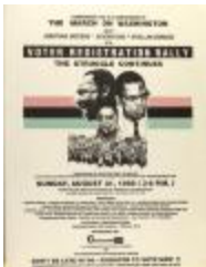
Voter Registration Rally - The Struggle Continues (RiPe_b20_f03_0026)