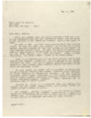
Correspondence to New York City Mayor David Dinkins (CENTRO_b95_f04_0062_pg01)