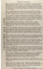
Fight Hate in Our Schools! (RiPe_b17_f11_0007)