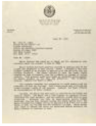
Correspondence from the New York City Mayor's Office (CENTRO_b95_f04_0061_pg01)