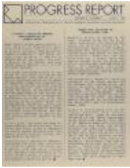
PROGRESS Report (CENTRO_b29_f01_0017_pg01)