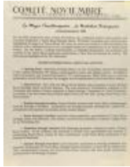
La Mujer Puertorriqueña . . . La Verdadera Borinqueña (CENTRO_b92_f03_0016_pg01)