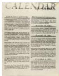
Calendar of Events - Comité Noviembre (CENTRO_b92_f04_0007_pg01)