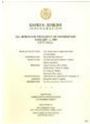
Reception for the Inauguration 23rd Borough President of Manhattan David Dinkins (EiCa_b09_f_0068)