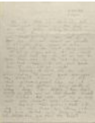
Correspondence from Metropolitan Correctional Center (RiPe_b24_f11_0013_pg01)