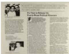
It's Time To Release The Puerto Rican Political Prisoners (RiPe_b24_f04_0007_pg01)