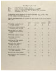
Correspondence from Community Service Society (RiPe_b28_f08_0007_pg01)