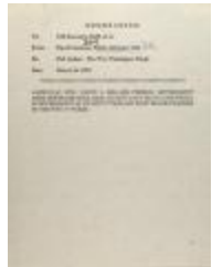
Correspondence from Community Service Society (RiPe_b28_f08_0029_pg01)