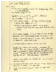
Notes on New Initiatives for Full Employment (NIFE) (CENTRO_b27_f08_0010)