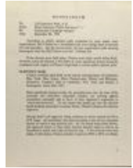
Correspondence from Community Service Society (RiPe_b28_f08_0008_pg01)