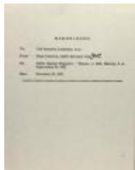
Correspondence from Community Service Society (RiPe_b28_f08_0024_pg01)