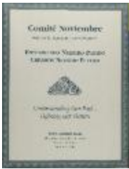
Entendiendo Nuestro Pasado, Creamos Nuestro Futuro / Understanding Our Past . . . Defining Our Future (RiPe_b27_f06_0015)