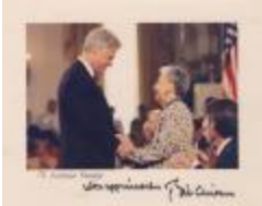
Antonia Pantoja and the U.S President Bill Clinton (AnPa_b26_f12_204)