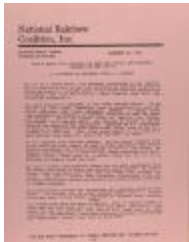
Bush's NAFTA Will Destroy Our Hope For Social And Economic Progress in 1990s (CENTRO_b26_f05_0029_pg01)