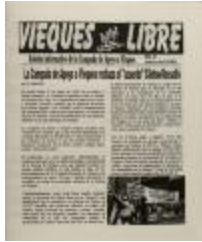
Vieques Libre (RiPe_b23_f04_0008_pg01)