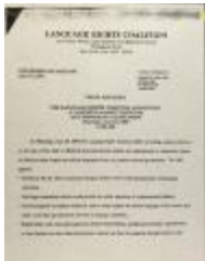
The Language Rights Coalition Announces a Campaign Against Nativism/Anti-Immigrant Legislation (RiPe_b24_f01_0037_pg01)