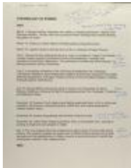
Chronology of Events (RiPe_b20_f09_0010_pg01)