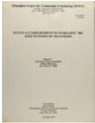
ECCO's Accomplishments in Increasing the Effectiveness of Organizers (RiPe_b26_f06_0012_pg01)