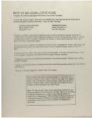
How To Do Legislative Work To Support The Amnesty Campaign For The Puerto Rican Political Prisoners (RiPe_b24_f04_0010_pg01)