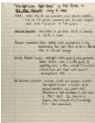
Notes on the Religious Right (RiPe_b24_f05_0024_pg01)