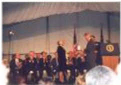
President Bill Clinton presenting award to Helen Rodríguez-Trías (HeRo_b07_f05_0009)