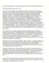
Op-Ed on President Clinton's Initiative on Childhood Immunizations (HeRo_b02_f011_0001)