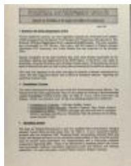
Political Development Update - Report on Activities of the Dept. for Political Development (RiPe_b29_f08_0007)