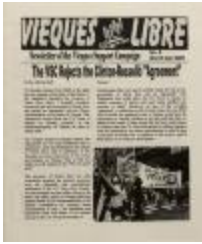
Vieques Libre (RiPe_b23_f04_0007_pg01)