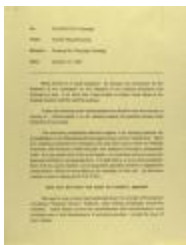
Correspondence from Vicente Alba (RiPe_b33_f06_0006_pg01)