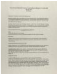
Notes From Political Prisoners/Leadership Training by ProLibertad (RiPe_b32_f05_0010)