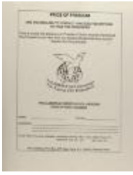
Price Of Freedom (RiPe_b24_f04_0009)