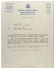
Correspondence from the Office of Congresswoman Nydia Velázquez (RiPe_b28_f09_0034)