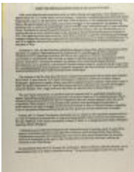
When The Struggle For Parole Is An Act In Futility (RiPe_b24_f02_0015_pg01)