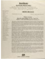
Clinton Attracts Record Latino Support in New York City - Number of Latino Elected Officials Increases from 23 to 24 (RiPe_b31_f06_0006)