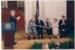
Presidential Medal of Freedom Ceremony (AnPa_b26_f12_0003)