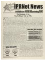
The Meaning of the Puerto Rican Vote in 1996 (RiPe_b31_f06_0005_pg01)