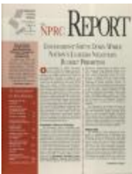
The NPRC Report (RiPe_b32_f05_0003_pg01)