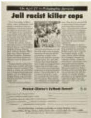
Jail Racist Killer Cops (RiPe_b20_f04_0021)