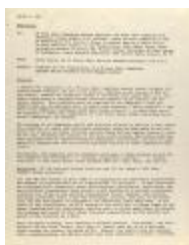
Correspondence from the National Rainbow Coalition (CENTRO_b27_f08_0018_pg01)