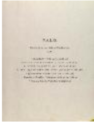
P.A.L.O. - Political Action Latino Organization - Agenda (RiPe_b33_f04_0001)