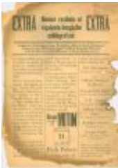
Extra Extra (EmVe_b07_f20_0002)