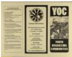
Youth Organizing Communities (RiPe_b34_f07_0001_r)