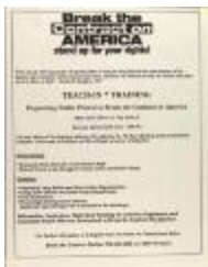
Break the Contract on America - Stand Up for Your Rights! (CENTRO_b27_f08_0004_pg01)