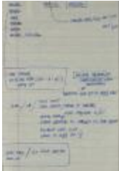
Notes on the American Friends Service Committee (CENTRO_b26_f05_0001_pg01)