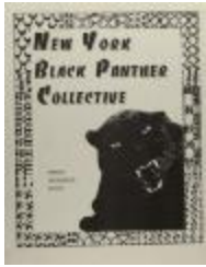
New York Black Panther Collective (RiPe_b31_f03_0008_pg01)