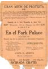
Gran Mitin de Protesta (EmVe_b02_f16_0002)