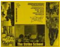
The Strike School (RiPe_b34_f07_0002_pg01)