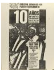
10 Años of Unity & Empowerment Por La Paz Y La Justicia Social / 10 Years of Unity & Empowerment for Peace and Social Justice (CENTRO_b94_f01_0073_pg01)