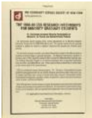
The 1988-89 CSS Research Internships For Minority Graduate Students (CENTRO_b27_f03_0002_pg01)