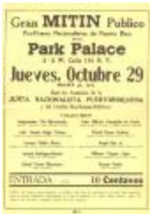
Gran Mitin Publico (EmVe_b02_f16_0001)