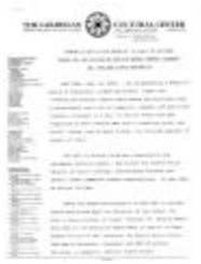
A Call to Action (EICa_b07_f_0004_pg01)