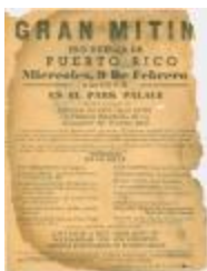
Gran Mitin (EmVe_b07_f20_0003)