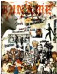
Cover page publication (EICa_b09_f_0074)