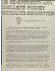
No Co-Operation with Kneller's Phoney Grievance Committee! (RiPe_b26_f02_0026_pg01)