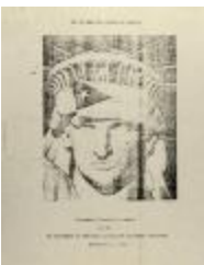
Why We Took the Statue of Liberty (RiPe_b24_f07_0004_pg01)