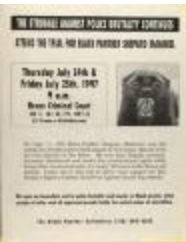
The Struggle Against Police Brutality Continues (RiPe_b20_f04_0035)