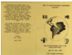
The 2nd Annual Black and Latino Unity Conference (RiPe_b18_f04_0003_pg01)