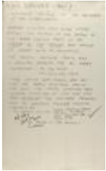
Black Panther Party (RiPe_b34_f04_0013)