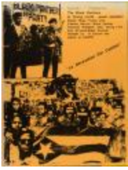
La Necesidad del Cambio / The Need For Change (RiPe_b34_f03_0007)