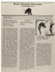
Black Panther Collective - Community News (RiPe_b23_f04_0005_pg01)