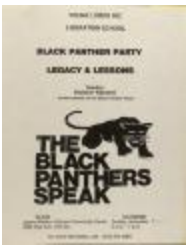
Black Panther Party - Legacy & Lessons (RiPe_b34_f04_0034)