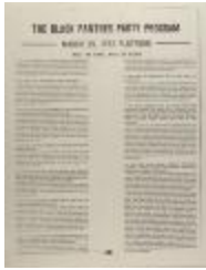
The Black Panther Party Platform (RiPe_b31_f03_0011)