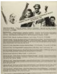
Puerto Rican Heritage & Awareness Month (RiPe_b20_f04_0008)