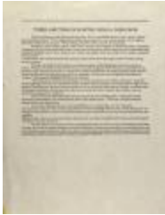
There Are Things Worth Living and Dying For (RiPe_b20_f08_0012)