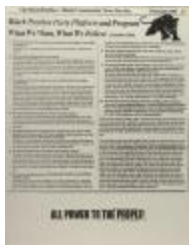
Black Panther Party Platform and Program - What We Want, What We Believe (RiPe_b31_f03_0010)