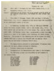
Correspondence from Special Services Division of the NYPD (RiPe_b34_f01_0021)