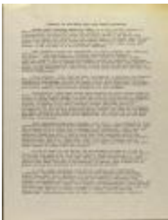
Proposal to the North Star Fund Youth Initiative (RiPe_b34_f06_0001_pg01)