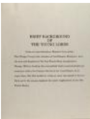
Brief Background of the Young Lords (RiPe_b34_f03_0001_pg01)