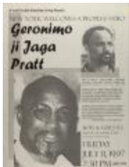
New York Welcomes a People's Hero (RiPe_b24_f04_0017)