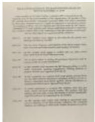
Rules and Regulations of the Black Panther Collective (RiPe_b31_f03_0009_pg01)