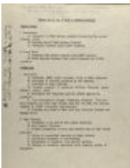
Teach-In on the State of Urban Wisdom (RiPe_b27_f01_0023_pg01)