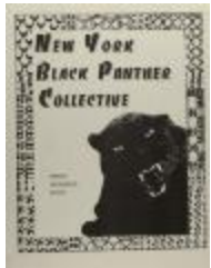
New York Black Panther Collective (RiPe_b31_f03_0008_pg01)