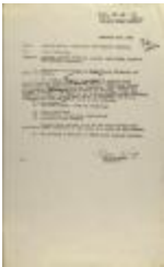
Correspondence from Special Services Division of the NYPD (RiPe_b34_f01_0019)