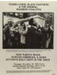
Young Lords, Black Panthers, & The Original Rainbow Coalition: How Puerto Rican, African American & Asian Activists Built Unity in the 1960s (RiPe_b34_f04_0045)