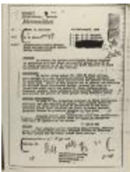
Correspondence to the United States Government (RiPe_b34_f01_0005)