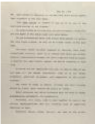
Open Letter to Prisoners in the New York State Prison System (RiPe_b24_f02_0016_pg01)