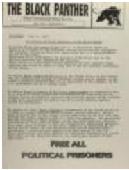
Definition of Black Prisoners in the United States (RiPe_b31_f03_0013)