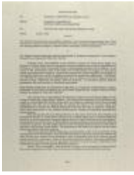
Report For 1994-1995 Programmatic Year (RiPe_b25_f07_0020_pg01)