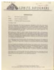
Correspondence from Comité Noviembre (CENTRO_b92_f03_0029_pg01)