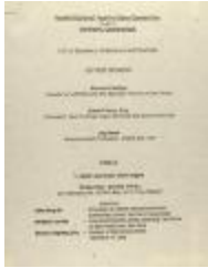
Fourth National Puerto Rican Convention (CENTRO_b94_f01_0010_pg01)