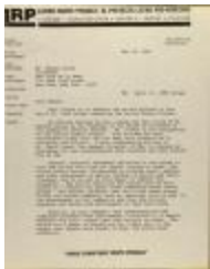
Correspondence from Latino Rights Project (RiPe_b31_f09_0013_pg01)