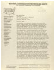
Correspondence from the National Congress for Puerto Rican Rights (CENTRO_b93_f10_0004_pg01)