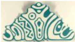
Comité Noviembre - Fourth Annual Gala (CENTRO_b93_f02_0017_pg01)