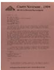
Correspondence from Comité Noviembre (CENTRO_b92_f06_0007_pg01)