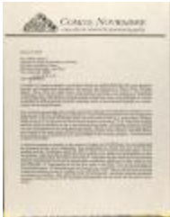
Correspondence from Comité Noviembre (CENTRO_b92_f03_0018_pg01)