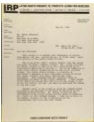
Correspondence from Latino Rights Project (RiPe_b31_f09_0014_pg01)