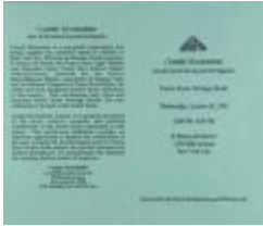
Comité Noviembre - Puerto Rican Heritage Month (CENTRO_b93_f01_0004_r)