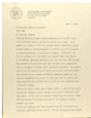
Correspondence from the Center for Puerto Rican Studies (CENTRO_b93_f09_0014_pg01)