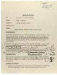
Correspondence from Comité Noviembre (CENTRO_b92_f08_0018_pg01)