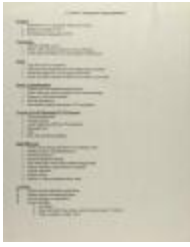
Current Chairperson Responsibilities (RiPe_b27_f06_0005_pg01)