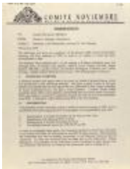
Correspondence from Comité Noviembre (CENTRO_b93_f02_0002_pg01)