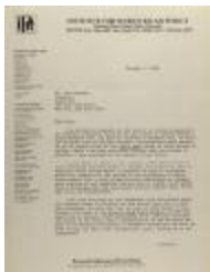
Correspondence from the Institute for Puerto Rican Policy (RiPe_b31_f05_0015_pg01)