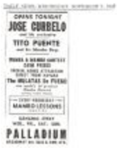
Flyer for José Curbelo and Tito Puente performances (CaOr_b20_f06_0003)