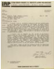
Correspondence from Latino Rights Project (RiPe_b31_f09_0012)