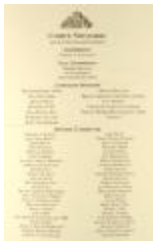
Comité Noviembre - Sixth Annual Benefit Event (CENTRO_b93_f03_0008_r)