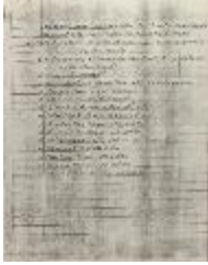
Notes on Community Service Society (RiPe_b28_f09_0036)