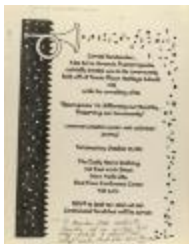
Reconquista '93: Affirming Our Identity . . . Preserving Our Community (CENTRO_b92_f05_0029)