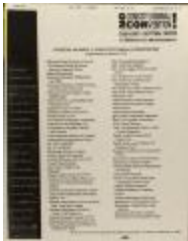
Citizens Against a Constitutional Convention (RiPe_b20_f09_0025_pg01)