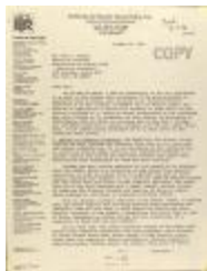
Correspondence from the Institute for Puerto Rican Policy (CENTRO_b93_f06_0021_pg01)