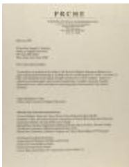
Correspondence from the Puerto Rican Council on Higher Education (CENTRO_b95_f06_0016)