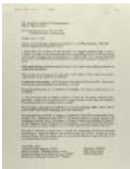
Memorandum from the Center for Puerto Rican Studies (RiPe_b25_f07_0014)