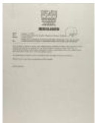
Correspondence from Puerto Rican Legal Defense & Education Fund (RiPe_b33_f10_0008_pg01)