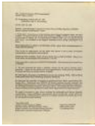
Correspondence from the Center for Puerto Rican Studies (CENTRO_b92_f07_0004)