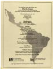
Puerto Rican and Hispanic Heritage Culture Months (CENTRO_b92_f07_0028)