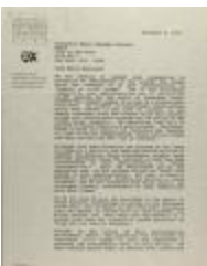
Correspondence from Puerto Rican Legal Defense & Education Fund (RiPe_b33_f10_0012_pg01)