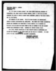
Correspondence to Pres. Lyndon B. Johnson (JeCo_b01_f07_0288)