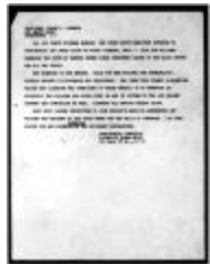
Call to President Lyndon B. Johnson to Fight Poverty and Withdraw Troops from Vietnam (JeCo_b01_f07_0293)