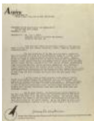
Testimony on the Selection of the Chancellor of the New York City Schools (CENTRO_b91_f08_0006_pg01)