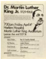
A Mass Public Rally in Memory of Martin Luther King, Jr. (CENTRO_b01_f06_0040_pg01)