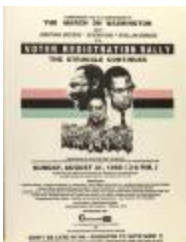
Voter Registration Rally - The Struggle Continues (RiPe_b20_f03_0026)