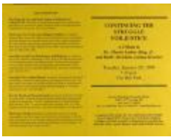
Continuing the Struggle for Justice: A Tribute to Dr. Martin Luther King, Jr. and Rabbi Abraham Joshua Heschel (RiPe_b19_f09_0018_pg01)