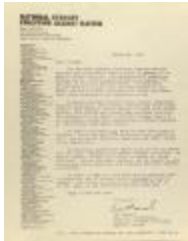
?Correspondence from National Student Coalition Against Racism of Columbia University (CENTRO_b01_f06_0039)