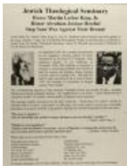
Honor Martin Luther King, Jr., Honor Rabbi Abraham Joshua Heschel, Stop Your War Against Your Dream!