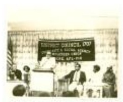
Poor People Campaign (GGV_b_f_0033_front)