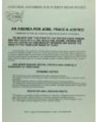
An Agenda for Jobs, Peace, & Justice