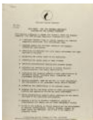
Fact Sheet: The 1988 National Democratic Platform and the Hispanic Community (RiPe_b20_f08_0027_pg01)