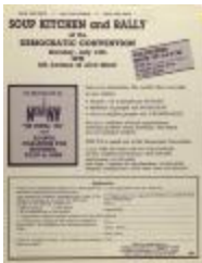
Soup Kitchen and Rally at the Democratic Convention (RiPe_b20_f01_0069)