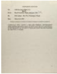
Correspondence from Community Service Society (RiPe_b28_f08_0029_pg01)