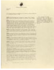
Correspondence from the Democratic National Committee (CENTRO_b27_f08_0008)