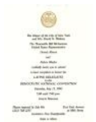
Invitation to reception honoring the Latino Delegates to the Democratic National Convention (EICa_b09_f_0061)