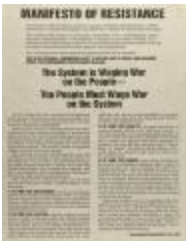
Manifesto of Resistance (RiPe_b20_f02_0050)