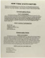
New York State Parties (RiPe_b30_f07_0015_pg01)