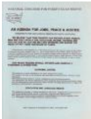
An Agenda for Jobs, Peace, & Justice (RiPe_0039)