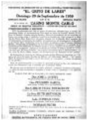
Grandiosa celebracion de la fecha nacional puertorriqueña, "El Grito de Lares" (JeCo_b21_f07_0003)