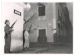
Takeover of Nationalist Party (RMRe_b38_f02_0003)