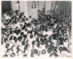
Albizu Campos at the center of a huge crowd (RMRe_b40_f01_0001)