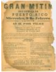
Gran Mitin (EmVe_b07_f20_0003)