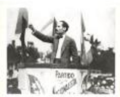
Albizu Campos at the Partido Nacionalista podium (RMRe_b38_f01_0010)