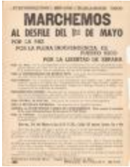
Marchemos al Desfile del 1st de Mayo (JeCo_b21_f08_0003_pg01)