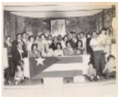
Group of people with a portrait of Pedro Albizu Campos as a prisoner on the back (RMR_b37_f03_500)