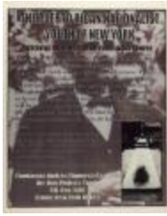
The Puerto Rican Nationalist Youth of New York - Preserving the Memory of Dr. Pedro Albizu Campos (RiPe_b20_f01_0022)