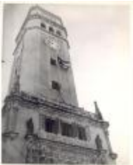
Universitarios Saludan Al Maestro Albizu Campos / University Students Greet Teacher Albizu Campos (RMRe_b04_f02_0001)