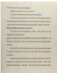
Where Do Political Prisoners Come From? (RiPe_b24_f04_0008_pg01)