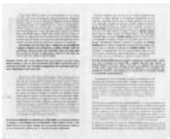
El Dr. Pedro Albizu Campos y Otros Presos Politicos Puertorriquenos (RMR_b24_f01_494_02)