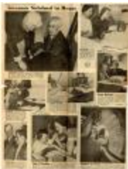
Gunman Subdued in House (OGPRUS_OIPR_b3298_f05_0001)