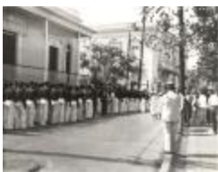
Nationalist Party Activities (ErVa_b05_f08_0006)