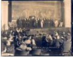
Velada De La Juventud Nacionalista De Puerto Rico / Evening of the Nationalist Youth of Puerto Rico (ErVa_b5_f4_Velada De La Juventud Nacionalista De Puerto Rico)