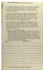
Stop Repression in Puerto Rico! (RiPe_b20_f08_0005)