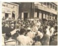
Pedro Albizu Campos amidst a demonstration (RMRe_b38_f02_0002_front)