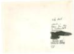
Demonstration at City Hall for the Nationalists Prisoners (JoEV_b09_f06_0001_back)