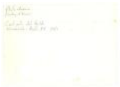
Contingente del Partido Nacionalista, Desfile Puertorriqueño (JoEV_b07_f07_0001_back)