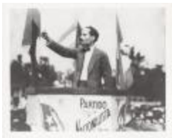
Pedro Albizu Campos at the Partido Nacionalista podium (RMR_b38_f01_485)