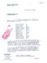
Informe para Record (RMRe_b48_f02_0002)