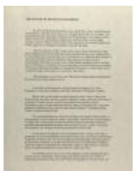
The Seizure of the Statue of Liberty (RiPe_b24_f07_0003_pg01)