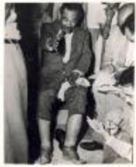
Albizu Campos Sitting In Chair With Swollen Legs (RMRe_b38_f01_0008)