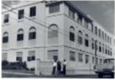
AI Urbie and Lydia Collazo outside Presbyterian Hospital during Peacemaker Test (RMRe_b01_f07_0001_front)