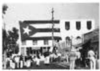
Nationalist Party marching in Lares, PR (GGV_b_fPhotographs_077)