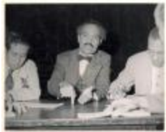
Albizu Campos talking at table with others (RMRe_b38_f02_0005)