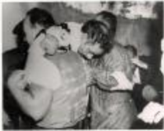
Pedro Albizu Campos being carried after police takeover at Nationalist Party event (RMRe_b38_f02_0001)