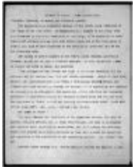
Remarks on Puerto Rican Independence (JeCo_b01_f06_0193)