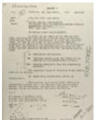
Groups Seeking Independence for Puerto Rico (Counterintelligence Program) Subversive Control (RiPe_b24_f04_0011_pg01)