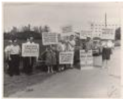
Protest for the Civil Rights in Puerto Rico, Protesta frente al Presidio (RMR_b37_f05_487)