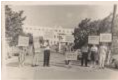
Women on a protest (EmVe_b10_f02_1077)