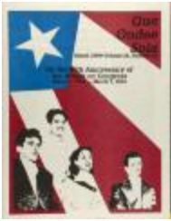
Que Ondee Sola (RiPe_b23_f03_0004_pg01)