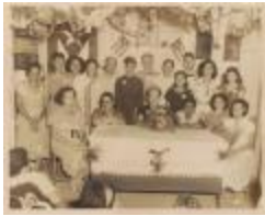
Inauguración Comité PIP- Marina- Barrio Obrero 58