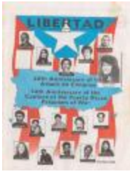
Libertad publication cover of the 40th Anniversary of the Attack on Congress (JoEV_b07_f12_0001)