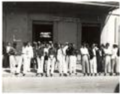
Nationalist Party in front of the Junto Nacionalista de Ponce (ErVa_b05_f08_0001)