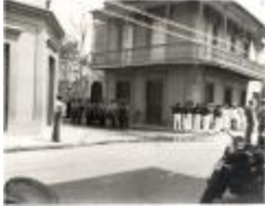
Nationalist Party Activities (ErVa_b05_f08_0003)