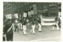
Contingente del Partido Nacionalista, Desfile Puertorriqueño (JoEV_b07_f07_0001_front)