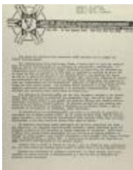
Comite Pro Libertad de Los Presos Nacionalistas Puertorriqueños / Committee For the Freedom of the Puerto Rican Nationalist Prisoner (RiPe_b24_f07_0001_pg01)