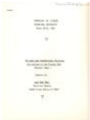
Symposium on Vieques (IsSa_b82_f01_002)