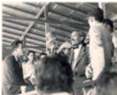
Albizu Campos at a microphone talking to the crowd (RMRe_b38_f02_0004)