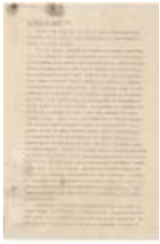
Al Pueblo de Puerto Rico (ErVa_b05_f31_0001)