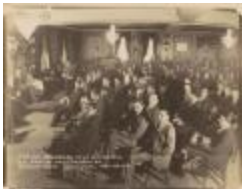
Annual meeting of the Puerto Rican Nationalist Party of New York (ErVa_b05_f04_0009)