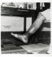
Leg of Pedro Albizu Campos (RMRe_b38_f01_0011)