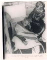
Pedro Albizu Campos semi-paralyzed in wheelchair (RMRe_b38_f01_0001)