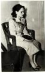
Lolita Lebron after the nationalist attack on Congress (RMRe_b38_f05_0001)