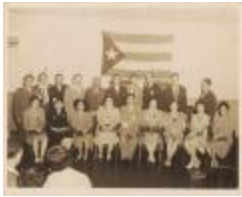
Group of people at the Acto Pro- Independencia de Puerto Rico en el "Oddfelos Temple" (ErVa_b05_f04_541)