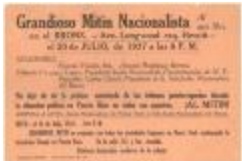
Grandioso Mitin Nacionalista / Grand Nationalist Rally (ErVa_b02_f13_0002)