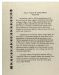
Oscar Collazo and Irving Flores Memorial (RiPe_b20_f03_0101)