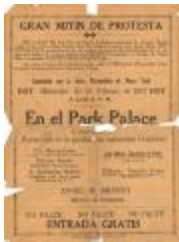
Gran Mitin de Protesta / Great Rally of Protest (ErVa_b02_f16_0003)