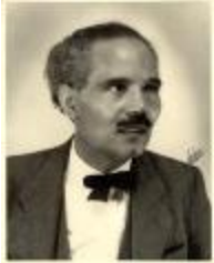
Pedro Albizu Campos (RMRe_b38_f01_0003_front)