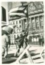
Demonstration at City Hall for the Nationalists Prisoners (JoEV_b09_f06_0001_front)