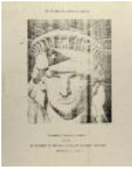
Why We Took the Statue of Liberty (RiPe_b24_f07_0004_pg01)