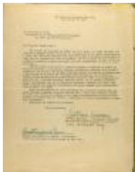
Correspondence from Junta Nacionalista Puertorriqueña de New York / Puerto Rican Nationalist Board of New York (JeCo_b17_f12_0002)