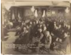
Magna Asamblea de la junta local del partido Nacionalista de Puerto Rico, Nueva York (ErVa_b05_f04_544)