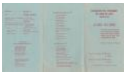
Celebración del Centenario del Grito de Lares (EmVe_b07_f25_1067_02)