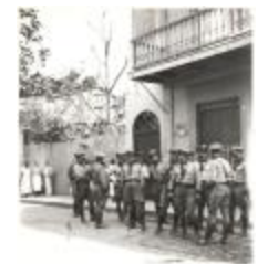
Nationalist Party Activities (ErVa_b05_f08_0004)