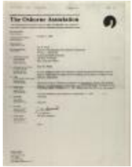
Correspondence from the Osborne Association (RiPe_b28_f10_0018)