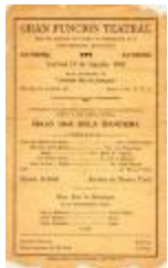
Bajo Una Sola Bandera / Under a Single Banner (ErVa_b02_f13_0001)