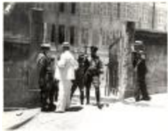
Nationalist Party Activities (ErVa_b05_f08_0002)