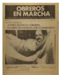
Obreros en Marcha (RiPe_b23_f01_0002_pg01)