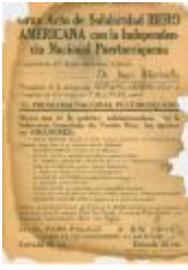
Acto de Solidaridad IberoAmericana (EmVe_b07_f20_0001)