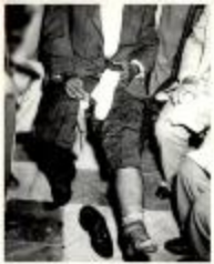
Pedro Albizu's swollen leg after leaving prison (RMRe_b38_f01_0009)