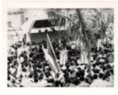
Recepción de Ponce (RMRe_b04_f01_0002_front)