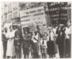
Parents Organization of East Lower Harlem, Supporting Puerto Rican Independence (JeCo_b44_f18_0001)