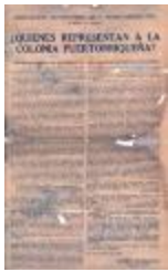
¿Quienes Representan a La Colonia Puertorriqueña? / Who Represents the Puerto Rican Colony? (ErVa_b02_f08_0001)