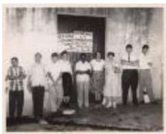
Members of the Peacemakers and the FUPI (Federacion Universitaria Pro- Independencia) (RMR_b37_f07_490)