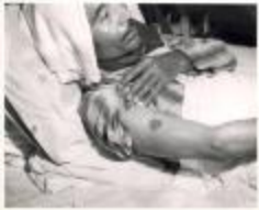
Albizu Campos' Arm (RMRe_b38_f01_0006)