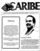
Caribe newsletter of the CUNY Association of Caribbean Studies (CACAS_b01_f03_004)