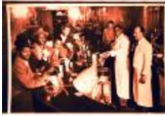
Afro-Cuban musician Machito with his friends (CaOr_b14_f01_0001)