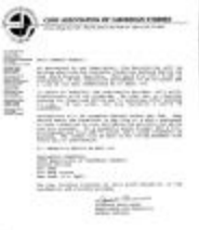
CUNY Association of Caribbean Studies membership letter regarding nomination polls for Executive Committee members (CACAS_b01_f03_003)