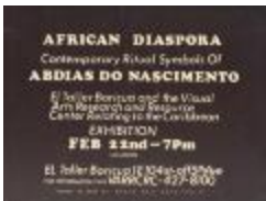
African Diaspora - Contemporary Ritual Symbols of Abdias Do Nascimento (OGPRUS_MD_b2220_f01_0002_front)