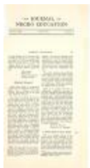
The Journal of Negro Education - A Puerto Rican in New York (JeCo_b1_f8_review)