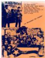
The Black Panthers & Young Lords (RiPe_0093)