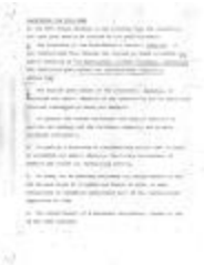
CUNY ASSOCIATION OF CARIBBEAN STUDIES ANNUAL REPORT 1985-1986 (CACAS_b01_f03_005)