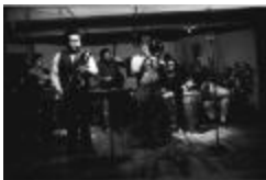
Conjunto Libre (CaOr_b14_f11_12_pg03_0001)