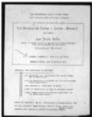
La Revolución Cubana y Latino-America / The Cuban Revolution and Latin America (JeCo_b01_f06_0248)