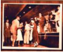
Afro-Cuban musician Machito performing with his band (CaOr_b14_f01_0002)