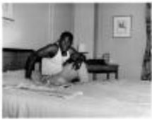
Orestes "Minnie" Miñoso (JAMa_bOSIII_0004)