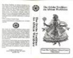
The Orisha Tradition: An African Worldview (EICa_b08_f_0007)