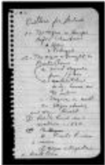
Outline for Lecture (JeCo_b01_f06_0210)