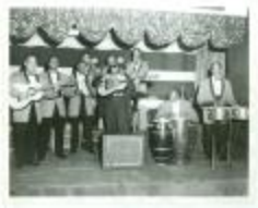
Arsenio Rodriguez and his band (JAMa_b09_f07_0001_front)