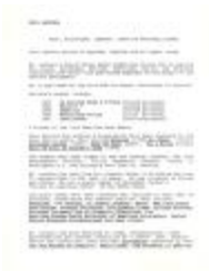
Tato Laviera - Biographical Description (TaLa_b01_f01_0059)