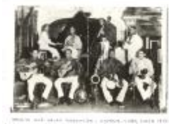
Machito and Grupo Redención (CaOr_b20_f09_0016)