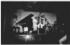
Conjunto Libre (CaOr_b14_f11_0002)