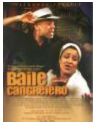
Baile Cangreiero (SaRo_b01_001)