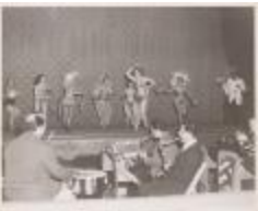
A group of Cuban performers on stage (JAMa_b09_f03_0002)