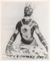
The Chango Macho (JAMa_b87_f06_0001)