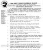
Terms of Reference of the Standing Committee for University exchange programs, CUNY Association of Caribbean Studies (CACAS_b01_f03_002)