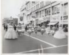
Latin American and Caribbean nations represented in a religious procession (JAMa_b88_f01_0004)