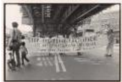
Stop the Movie "Fort Apache", It's Anti Puerto Rican, Anti Black (Committee Against Fort Apache)