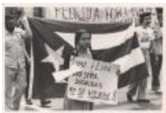
Protest against the film Fort Apache, the Bronx (LoTo_b15_f11_578)