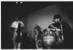
Conjunto Libre (CaOr_b14_f11_0001)