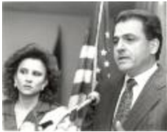
Nydia Velázquez and Rafael Hernández Colón (OGPRUS_DPRCA_0022)