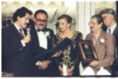
Nydia Velázquez Being Presented With Award (OGPRUS_DPRCA_b04_0043)