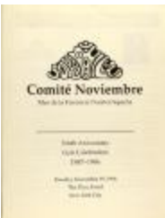
Comité Noviembre - Tenth Anniversary Gala Celebration (CENTRO_b93_f01_0010_pg01)