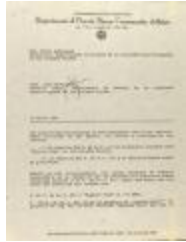
Protest Against "English-Only" Movement in the United States (CENTRO_b97_f06_0048_pg01)