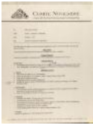
Correspondence from Comité Noviembre (CENTRO_b92_f07_0020_pg01)