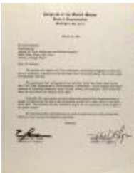
Correspondence from Nydia Velázquez (RiPe_b19_f08_0013)