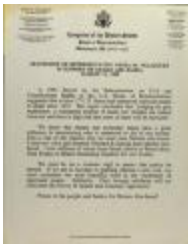
Statement of Representative Nydia Velázquez in Support of Mumia Abu-Jamal (RiPe_b24_f01_0034)