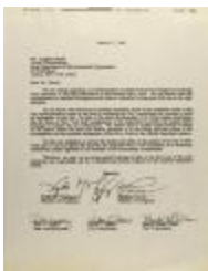
Correspondence from Nydia Velázquez (RiPe_b19_f08_0014)