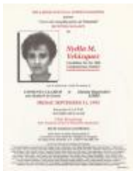
Flyer for the re-election of Nydia Velazquez to Congress (AICa_b05_fNV_1315)