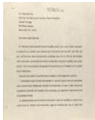
Correspondence from Comité de Afiración Puertorriqueña (CENTRO_b92_f02_0004_pg01)