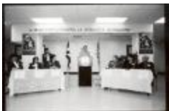
Nydia Velázquez presenting at a podium (OGPRUS_DPRCA_b02_f10_0001)