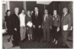
Olga Méndez, Nydia Velázquez and other politicians at a social activity (OGPRUS_DPRCA_b04_f03_1270)