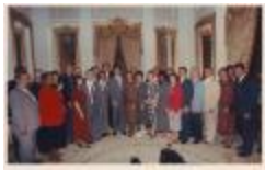
Politicians at gala event at La Fortaleza (OGPRUS_DPRCA_b04_f06_1272)