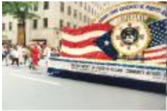
Department of Puerto Rican Community Affairs Commonwealth float (OGPRUS_DPRCA_0003)