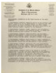
Environmental Initiatives in the First Session of the 103rd Congress (RiPe_b19_f08_0008_pg01)