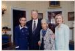
Nydia Velazquez, Bill Clinton, Antonia Pantoja, and Hillary Clinton