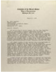
Correspondence from the United States Congress (RiPe_b19_f08_0010_pg01)