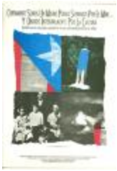
Strengthening the Bridge Between the Two Communities (OGPRUS_DPRCA_bUnknown_f20_0001_front)