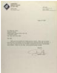
Correspondence from Community Service Society (RiPe_b28_f09_0012)