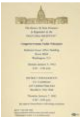
Inaugural Reception of Nydia Velázquez (CENTRO_b92_f04_0014)