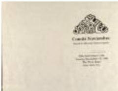
Comité Noviembre - 10th Anniversary Gala (CENTRO_b93_f01_0009_pg01)