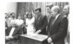
Creation of the Department of Puerto Rican Community Affairs (OGPRUS_DPRCA_0017)