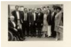
Signing of Executive Order Granting Custody of the "Historical Archives of the Puerto Rican Migration to the US" to Centro by Governor Pedro J. Rosselló (CENTRO_b223_f10_0002_r)