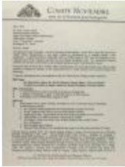
Correspondence from Comité Noviembre (RiPe_b27_f05_0026_pg01)