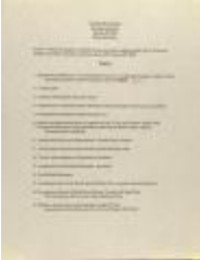
Comité Noviembre - Opening Reception Program (CENTRO_b92_f06_0015)