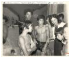
Nydia Velázquez and children (OGPRUS_DPRCA_0005)