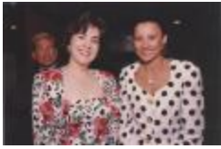
Sila Calderon and Nydia Velázquez (OGPRUS_DPRCA_0018)