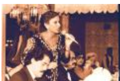
Nydia Velázquez Giving a Speech (OGPRUS_DPRCA_b04_0028)