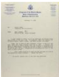
Correspondence from the Office of Congresswoman Nydia Velázquez (RiPe_b28_f09_0034)