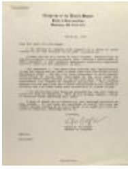
Correspondence from Nydia Velázquez (RiPe_b19_f08_0009)