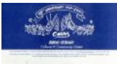
35th Anniversary of CHARAS 1965-2000 (Charas_0061_01)