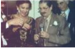
Nydia Velázquez Being Presented With Award (OGPRUS_DPRCA_b04_0071)