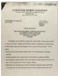
The Language Rights Coalition Announces a Campaign Against Nativism/Anti-Immigrant Legislation (RiPe_b24_f01_0037_pg01)