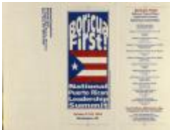
Boricua First! - National Puerto Rican Leadership Summit (CENTRO_b98_f07_0016_pg01)