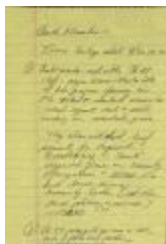
Notes on Comité Noviembre (CENTRO_b92_f04_0005_pg01)