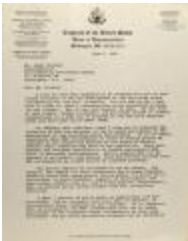
Correspondence from Nydia Velázquez (RiPe_b19_f08_0012_pg01)