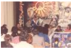
Nydia Velázquez delivering a presentation as Director of the DPRCA (OGPRUS_DPRCA_b01_0004)