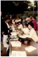
Atrevete (Dare to Go for It!) (OGPRUS_DPRCA_0020)