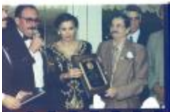
Nydia Velázquez Being Presented With Award (OGPRUS_DPRCA_b04_0020)