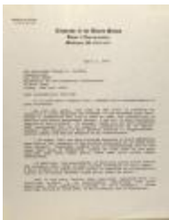
Correspondence from Nydia Velázquez (RiPe_b19_f08_0011_pg01)