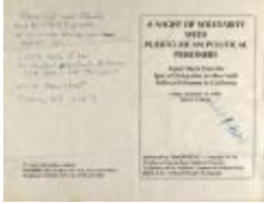
A Night of Solidarity with Puerto Rican Political Prisoners (RiPe_b19_f09_0017_pg01)