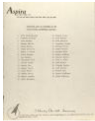
Tentative List of Invitees to the Puerto Rican Leadership Dialogue (CENTRO_b91_f04_0006)