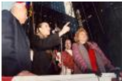
Nydia Velázquez Giving a Speech (OGPRUS_DPRCA_b05_f02_0002)