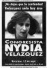
Newspaper ad for Congresswoman Nydia Velazquez (AICa_b05_fc_0001)