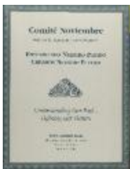
Entendiendo Nuestro Pasado, Creamos Nuestro Futuro / Understanding Our Past . . . Defining Our Future (RiPe_b27_f06_0015)