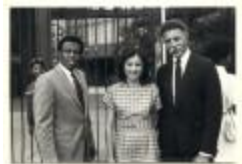
Department of Puerto Rican Community Affairs Director, Nydia Velázquez, and Oakland Mayor Ronald Dellums (OGPRUS_DPRCA_0004)