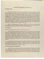
Puerto Rican Heritage Month - 1994 (CENTRO_b92_f06_0004_pg01)