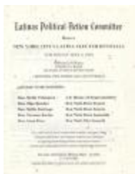
Flyer from Latinas Political Action Committee honoring New York City's Latina Elected Officials (AICa_b05_fNV_1316)