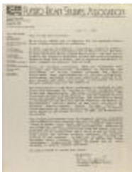
Correspondence from the Puerto Rican Studies Association (CENTRO_b98_f07_0009)