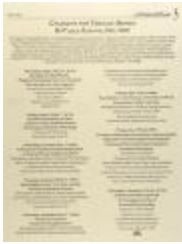
Noticias del Centro / Center News (RiPe_b25_f09_0012_pg01)