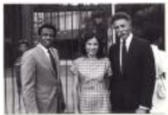
Edolphus Towns, Nydia Velázquez, and Ron Dellums