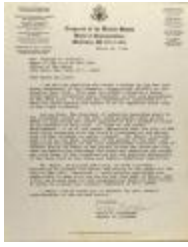
Correspondence from Nydia Velázquez (RiPe_b19_f08_0015)