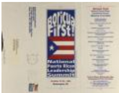
Boricua First! National Puerto Rican Leadership Summit brochure (RiPe_b17_f07_0003_r)