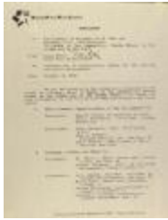
Memorandum from the National Puerto Rican Coalition (CENTRO_b95_f01_0019_pg01)