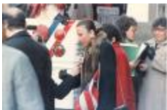
Nydia Velázquez Being Interviewed by Telemundo (OGPRUS_DPRCA_b05_f02_0001)