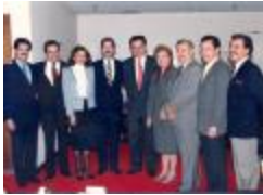
Jose Serrano, Nydia Velázquez, Rafael Hernández Colón, Fernando Ferrer, and Olga Méndez (OGPRUS_DPRCA_b04_f02_0001)