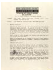
National Congress for Puerto Rican Rights Education Fund Board Meeting - Minutes (CENTRO_b93_f11_0025_pg01)