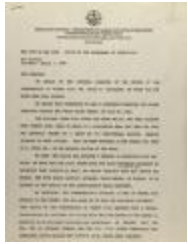
Migration Division - Department of Labor and Human Rights (RiPe_b21_f08_0025_pg01)