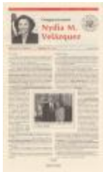
Newsletter from Congresswoman Nydia Velazquez, 12th Congressional District (AICa_b05_fNV_0001_pg01)