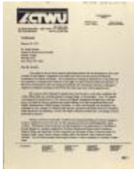
Correspondence from ACTWU (Amalgamated Clothing and Textile Workers Union) (CENTRO_b27_f08_0040_pg01)